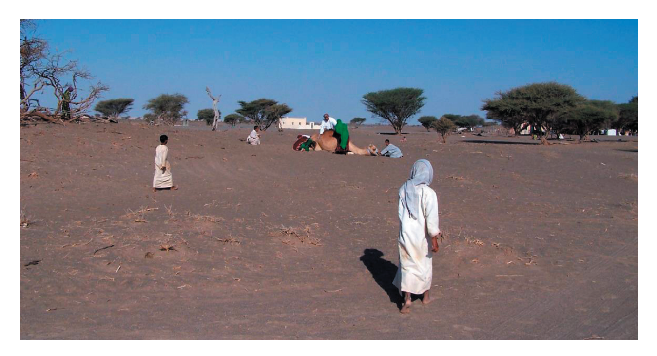
Figure 2. The female camel tied in a sitting position by the owners.

In Dhofar, camel pastoralists were asked about their method of treating recurrent miscarriages. More than one informant stressed that the camel is usually burned on the skin with a hot iron (Fig. 4). The cauterization is made on both sides of the animal. The continuous use