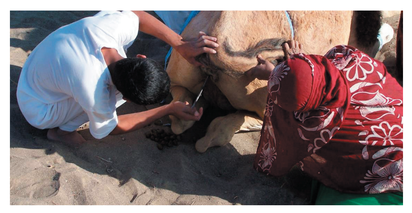
Figure 3. A red-hot iron was inserted into the camel's vagina.

of this procedure by Bedouins speaks for its validity as a treatment method.