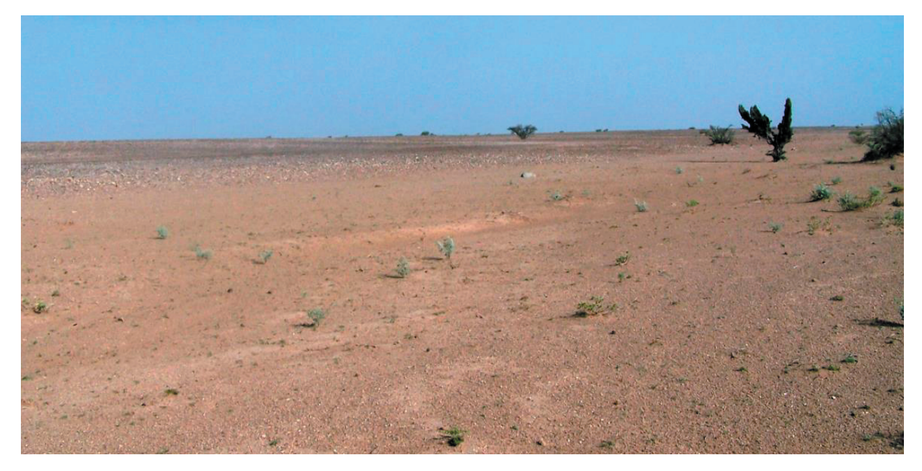
Figure 1. Naffas at Al Madiabi in the interior of Oman.

but that any female camel that continuously aborted was treated in a similar way.