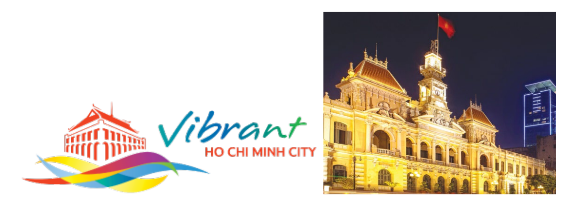
Figure 5. Vibrant Ho Chi Minh City (2011)