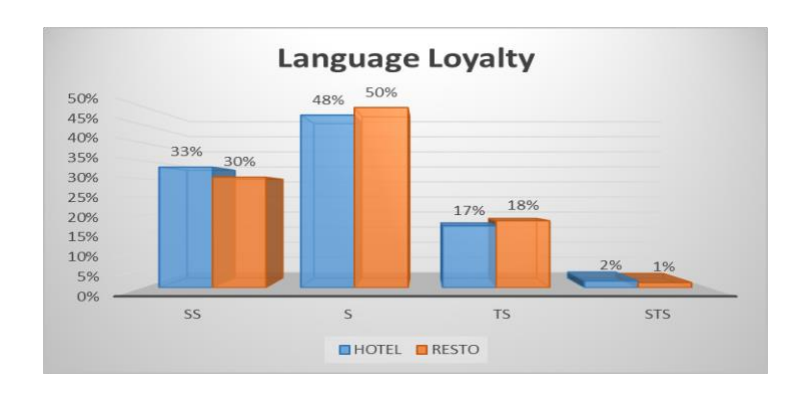
Graph 1: Loyalty to the Use of Indonesian by Entrepreneurs in Bali

Loyalty to the Indonesian language in the questionnaire contains 16 statements. The 16 statements consist of 14 positive statements and 2 negative statements. Based on inferential statistics on the statement data given by the two categories of respondents, it was obtained the following average values. For the positive statement category, the average value was 81.2. The average value was included in a good category interval point, while for the negative statement the average value of 72.5 was included in the fairly good interval points. Meanwhile, based on the tabulation of data collected in both tourism areas in the Province of Bali, it can be illustrated the percentage of loyalty to the Indonesian language obtained by entrepreneurs in Bali as shown in the following graph.