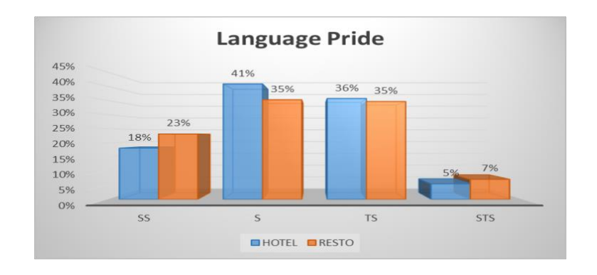
Graph 2: The pride of the Use of Indonesian by Entrepreneurs in Bali

Statements of pride in Indonesian in the questionnaire contained 12 items. The twelve items consist of seven positive statements and five negative statements. The results of inferential statistical calculations on statements of pride in the Indonesian language by the two categories of respondents obtained an average value for a positive statement of 79.5 which is at a good categorical interval point, while for negative statements it obtained an average value of 72.5 belongs to a fairly good category. Meanwhile, the value of the percentage accumulation of the sixteen items can be seen in the following graph.