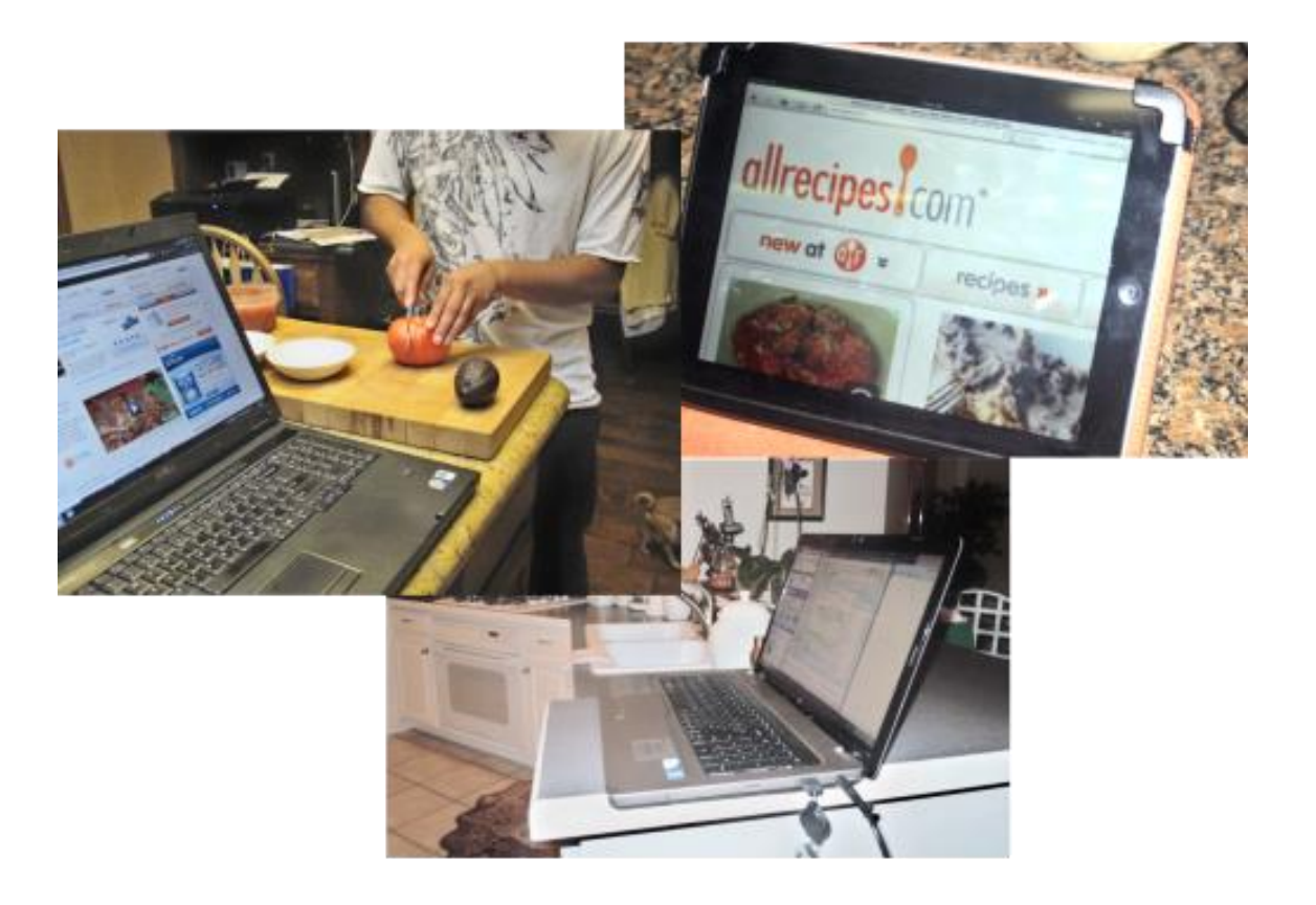
Figure 2: Sample photos

accidental spills and everyday kitchen grime.