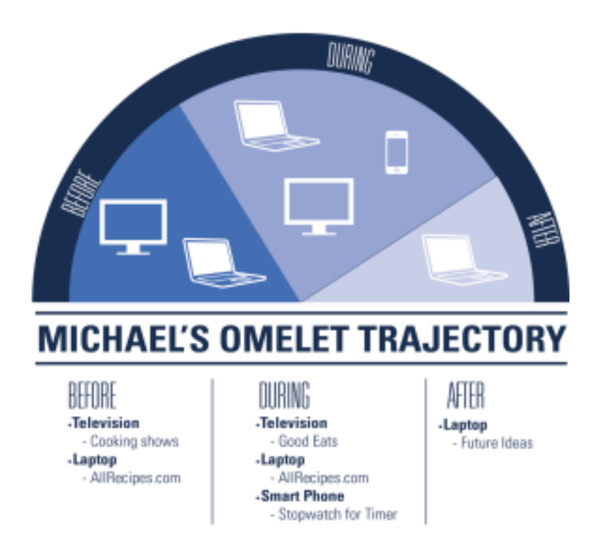
Figure 1: The Omelet Trajectory

As noted in a project overview document prepared by Crysta Metcalf, the kitchen is often described as "the heart of the home," and much research has been done on family activities in the kitchen. Most ideas for technology innovations that have resulted from such research revolve around family calendars, ways of coordinating and keeping track of family activities, and so on. Yet much of what is done in the kitchen is food preparation. Metcalf believed that there was an opportunity to discover and understand people's needs and desires around the specific activity of cooking, and to invent new applications and services that could address those needs.