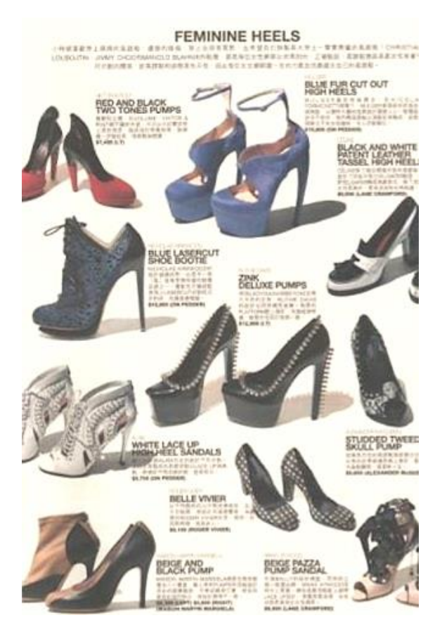
Figure 2. Example of Kris's product styling. Red-lacquered soles of Christian Louboutin and other branded high heels.