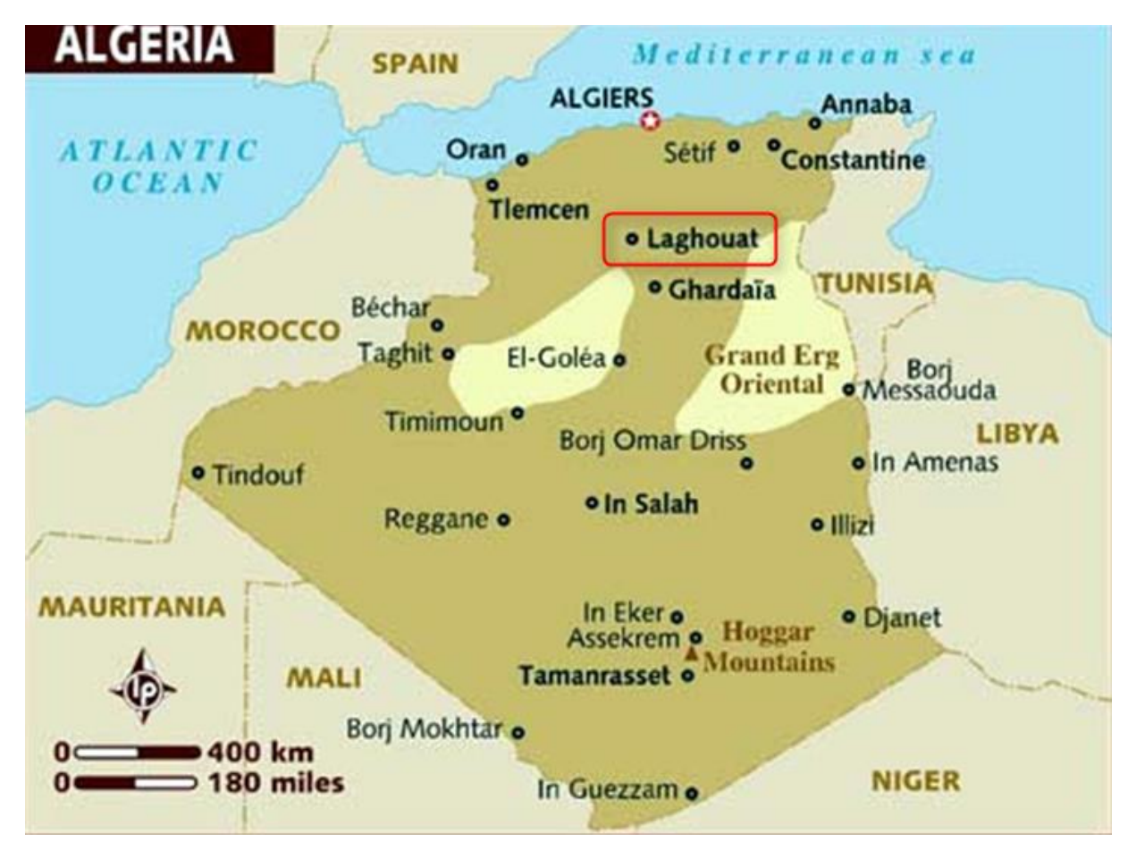
Fig 1.. Map of Algeria, situation of Laghouat.