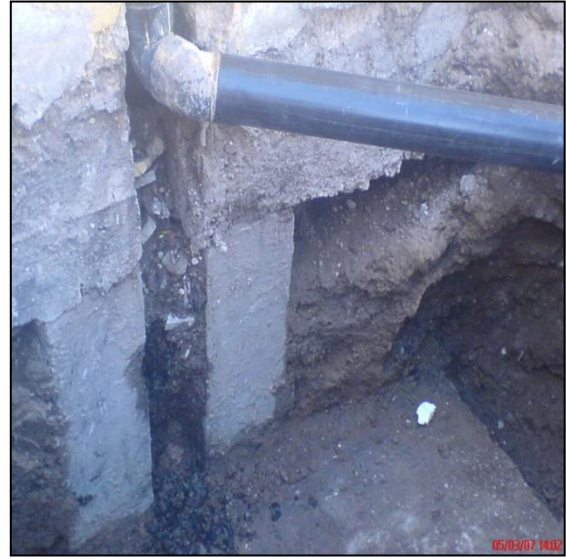
Fig 5. Infiltration of wastewater through cracked pipes.