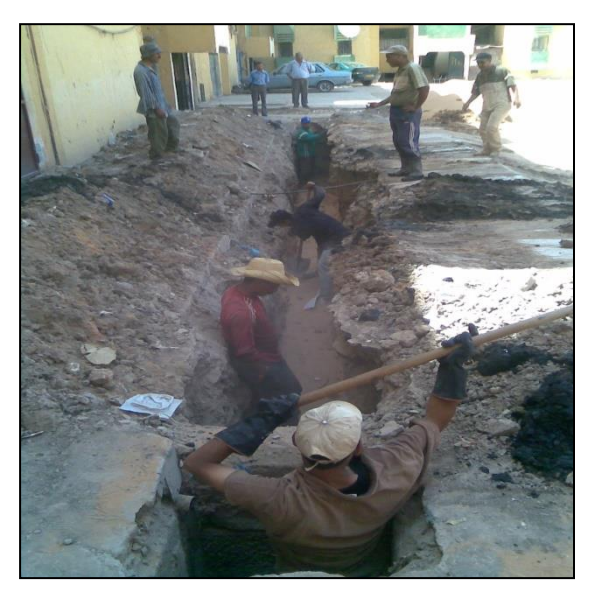
Fig 6. Main manhole sewers were moved completely outside the building.