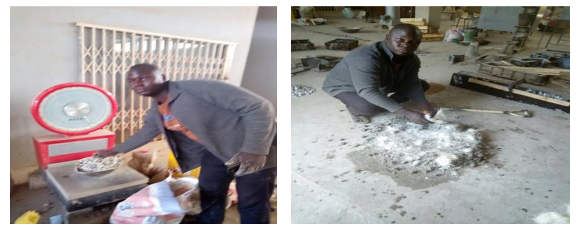
Fig. 3. Some procedures in the Experiment