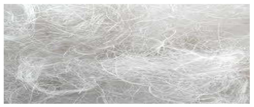
Fig. 1. Sample of Sisal fibre.

It was cut into 4cm length. The sample of the sisal fibre used in this study is presented in Figure 1. The results of the research work carried out by Sani et al., (2017) on the properties of sisal fibre was adopted for this investigation as presented in Table 1.