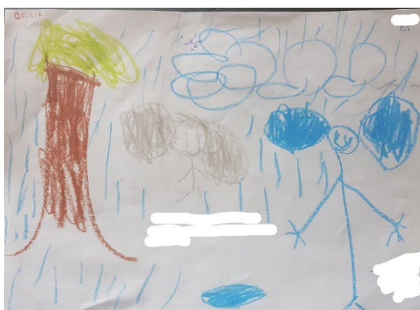
Figure 3. C17's drawing

In the second category, adding unusual features to objects or people was another way that the children created humour, with some of the children making absurd changes in terms of the colour, shape, size or number of something, as illustrated in the drawing below.