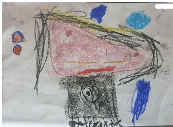
Figure 2. C13's drawing

There is a weird girl with a moustache. She also has more than one leg and a bottom on her belly. This is funny.