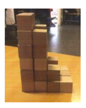
How many blocks are there in the building?

During the second lesson, when the students were to pose a similar task to a friend, the students had access to building blocks, paper and pens. As previously mentioned, they did not have to write their problem-solving task by themselves; instead, they could formulate it to their teacher, who wrote it down for them. All pairs/groups of students built a building with blocks, and all but one group posed a question connected to this building. The student who did not pose a problem-solving question was working by himself. He built a building with blocks but then said that it was not possible to pose a question. The other students both built a building and formulated a question, below are three examples of building built and questions posed by the students (Figure 2).