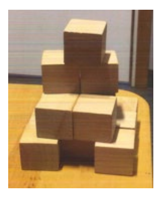
How do you make them talk? (Hur får man dom att prata?)