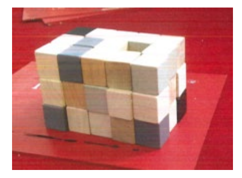
How deep is the hole if it has 42 blocks? (Hur djupt är hålet om den har 42 klossar?)