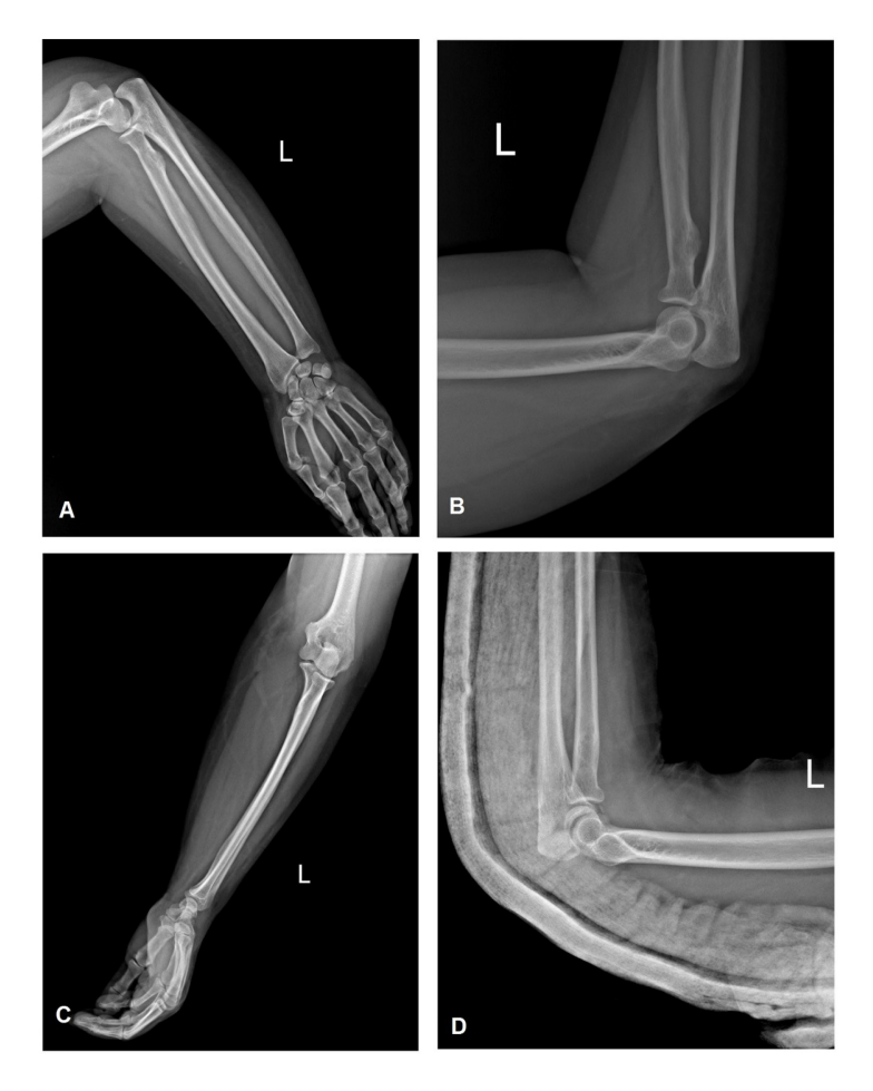
Fig. 1 Radiographs of the elbow joint for diagnosis of dislocation. (A) & (B) Lateral radiographs and (C) anteroposterior radiograph showed no distinct signs of lateral dislocation of the left elbow, (D) Lateral radiograph of elbow after closed reduction.