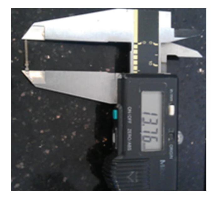
Fig. 1 Pin length measurement by digital caliper.