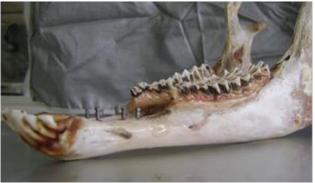
Fig. 4 Pins inserted into dry sheep mandibles.

After image reconstruction by NNT Viewer software, linear measurements were made by three oral and maxillofacial radiologists at 100%, 200% and 400% magnifications. The observers were allowed to change the contrast, sharpness and brightness of the images, which were displayed on a monitor with 1024 × 1280 pixels resolution and 32-bit color depth.