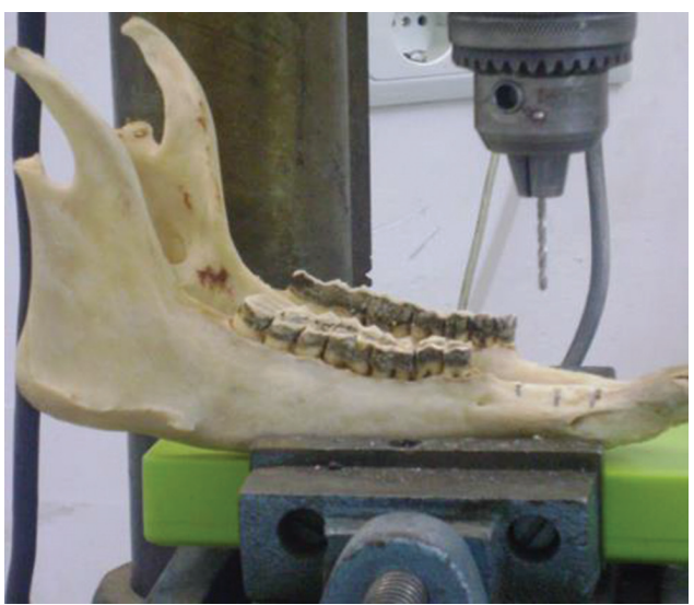
Fig. 3 Parallel drilling of implant holes.