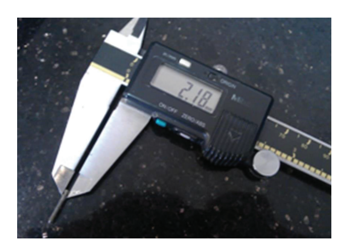
Fig. 2 Pin diameter measurement by digital caliper.

To facilitate measurement in the axial plane, diameter of the pin heads was considered as the diameter of the pins.