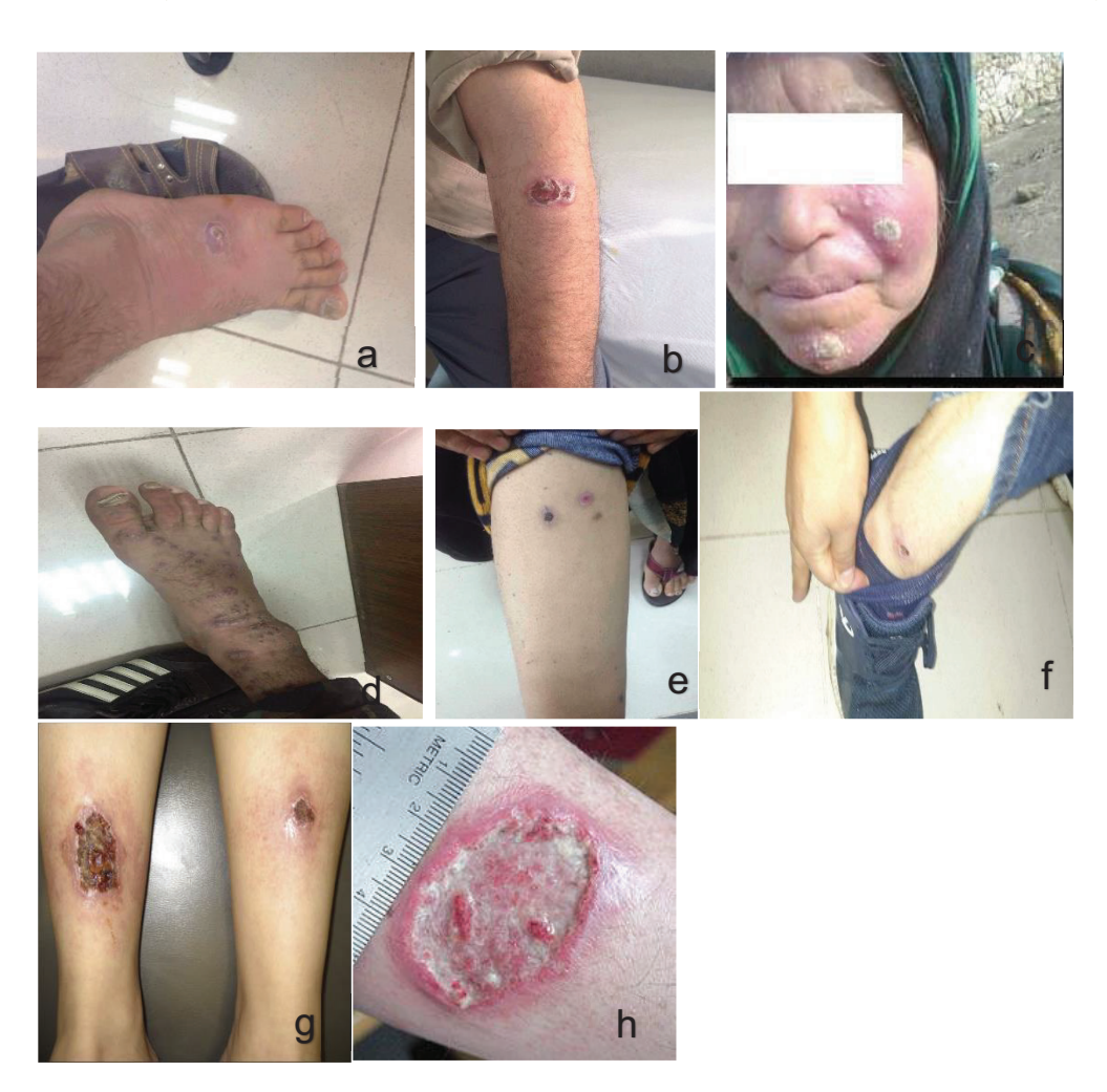
Fig. 1 (a-h) Distribution of different lesions regarding: site, size, number, gender, type of lesion.