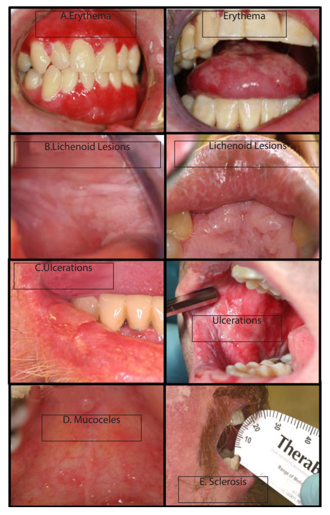
Fig. 2. Various clinical manifestations of oral cGVHD. (a) erythema of the tongue and oral mucosa, (b) lichenoid lesions occurred on the lips, buccal mucosa, and other regions of the oral cavity, (c) oral ulcers, (d) mucoceles formed on the hard palate and occasionally below labial mucosa, and (e) peri-oral sclerosis that restricts the opening of mouth. Derived from JW et al.28

hyperkeratotic leukoplakias which is white plaques or thickened, hyperplastic mucosa. The oral mucosal lesions are not painful most of the times and considered as diagnostic signs for oral cGVHD while evaluation of post-HSCT.<sup>16</sup>