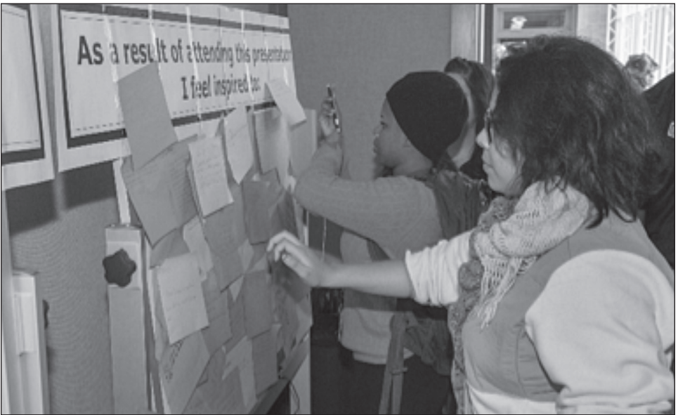
Students affix their responses to an author's presentation using large sticky notes, which later were categorized into major themes by program administrators.