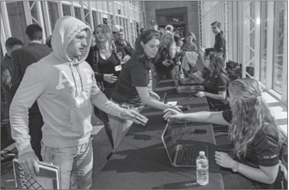
Student workers check students in for an author visit through ID matching.