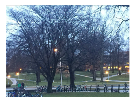
Figure 4. A photovoice photograph taken by Sarah.

This emotion provoking photo is in honor of a young Black man back home, in a nearby Detroit neighborhood, whose life