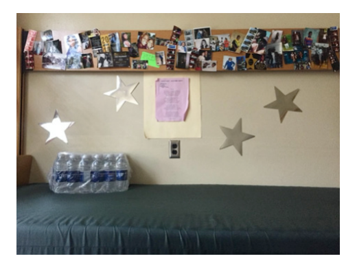
Figure 3. A photovoice photograph taken by Regina.

I photographed my dormitory bed, intentionally framed by images reminding me where I came from: a case of water bottles unopened, a poem that reckons with meanings of resilience, and stars, tilted upward, that reflect my passion to rise. These points work together to render an image that sings my lived