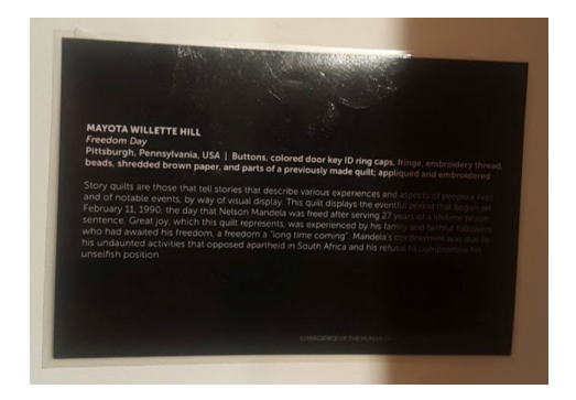
Figure 1. Credit panel describing the "Freedom Day" quilt.

considers how educational communities including teacher educators, education researchers, and student affairs educators may meaningfully incorporate knowledge, perspectives, and questions of undergraduate researchers, which are an integral part of their transition experiences.