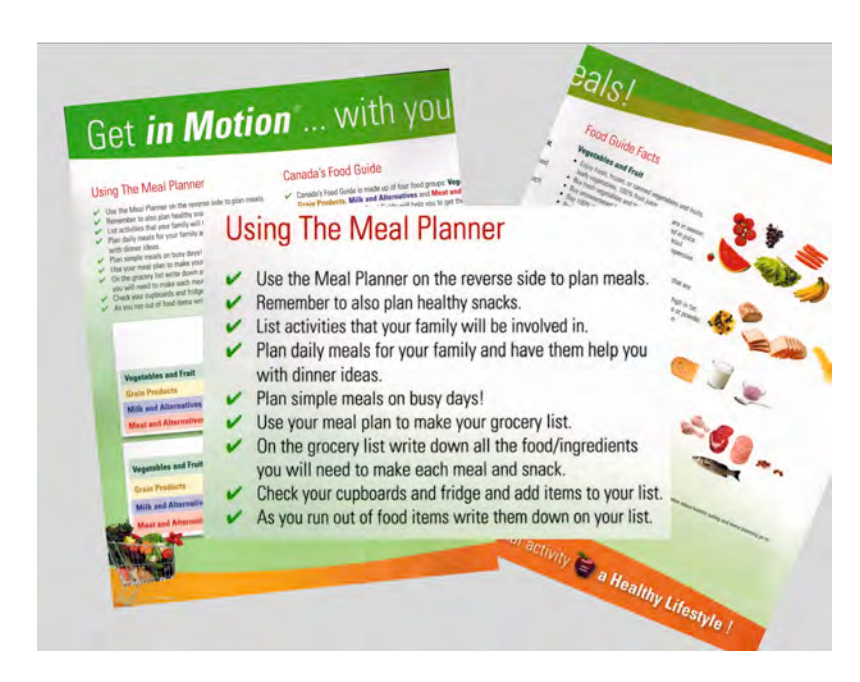
Figure 3: Menu Planning and Budgeting as Literacy Practices

Later I reflect on my feelings about the conversation. I thought of myself as an involved parent back in the early 1990s, but I wouldn't have used the planner and still feel alienated by its direct "do this" tone and images of supermarket-style loaves of white bread. But even if the food images had been reflective of the cultural diversity of Ontario families, I wouldn't have wanted to use a planner for meal planning. I concluded that it would take more self-regulation than I mobilized as a parent.