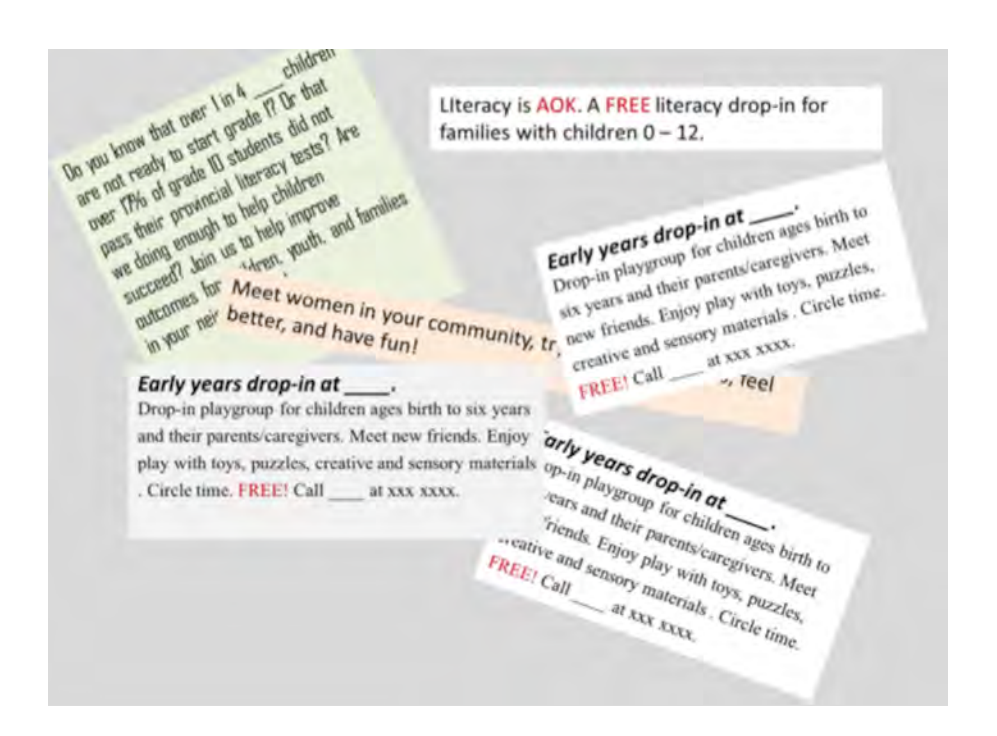
Figure 4: A Resource-Rich Neighbourhood Provides Access to Programs

Where the planned everyday life literacy activities enjoyed only limited take up, informal and authentic literacy practices appeared to be more effective in achieving their purposes. I was struck by the number of events that featured the use of planners, calendars and schedules. The settlement worker, for example, always appeared to have a program brochure in her hand. She told me that newcomers can feel very isolated. She wanted people to know that they could be out and about in the neighbourhood every day of the week. She said that the days of the week are among the first English words that newcomers learn and she was using the brochure to reassure people that they did not need to feel isolated because any day of the week they could find a program that would welcome them. Yet there was little variety in the programs and they undoubtedly privileged monolingual approaches to literacy. An invitation to participate was therefore also an invitation to be assimilated in an English speaking community. Here was a quintessential illustration of Iannacci's observation that neoliberal assemblages create both possibilities and limitations.