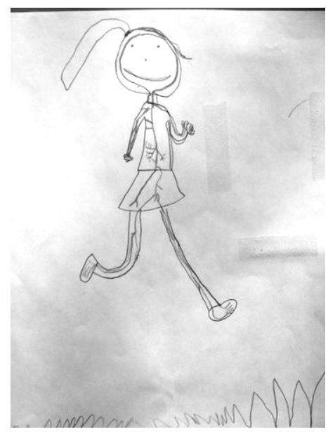
Figure 7. Simran: Your head tells your legs to run fast.

Debbie introduced many other activities connected to movement and body awareness throughout this period, from yoga poses in the gym, to daily exercise with a Grade 3 class whose members guided the kindergarten children through the movements in pairs. A mother with a baby visited and sparked much discussion