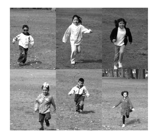
Look how high my legs are.

Debbie showed the children images of themselves running, both still images and video on the TV monitor. They all wanted to see themselves, noting differences in individual movements as they ran.