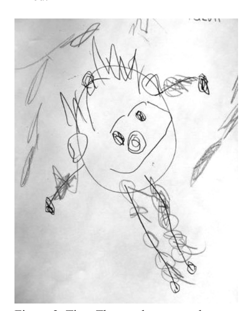
Figure 3. Tim: The wind goes inside me.

After the children had tried drawing an image of themselves running from a still photograph or video image, Debbie invited them to show their theory about how we run fast on the drawing. She wanted to control the palette to make the theories show up well and thought she would ask the children to draw their theory in red pencil. This invitation made the children think intentionally about their theory and how to represent it on their drawing. We share examples of five of the children's theories to convey their approach to this invitation, and the clarity of the presentation with the controlled palette of figure pencil drawing and theory in red.