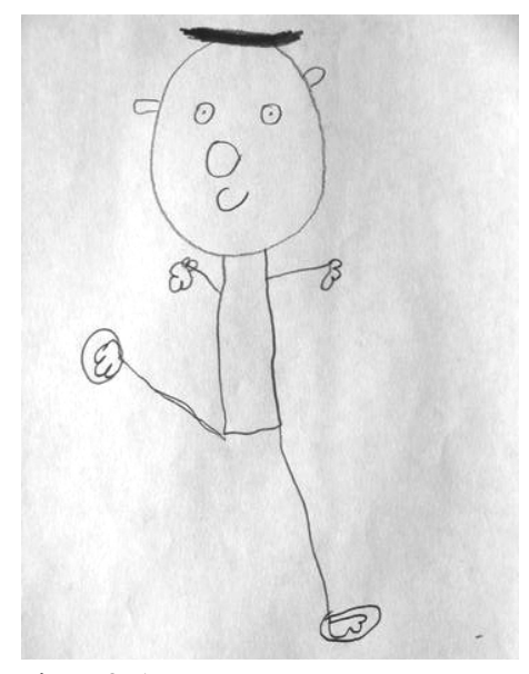
Figure 2: Attempt to represent movement

added two movable mannequins to the drawing table so the children could put a mannequin in their own poses as an aid to drawing. Some children enjoyed posing the mannequin and referred to it, and some used their own images. Debbie found it intriguing that some children who normally drew stick figures were able to capture a clearer representation by using their photograph.