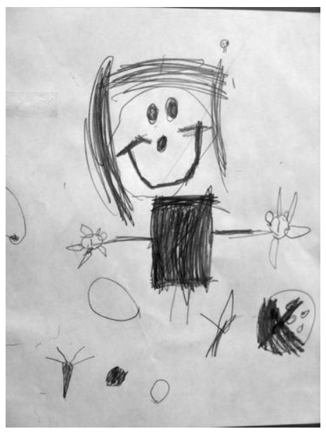
Figure 5. Maria: Your bones are moving when you run.