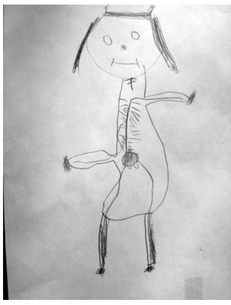
Figure 4. Hailey: I think it's about the blood running through your body. Your blood goes all over the place.