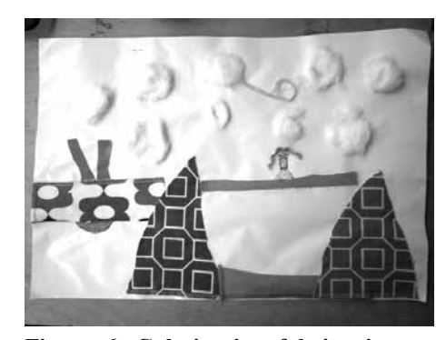
Figure 6. Culminating fabric picture, Korphe, Pakistan.

In Figure 5, grade 2 student Leah is receiving support for below-grade reading and writing skills. However, her detailed drawings represent her knowledge when comparing her community with a community in Pakistan. Note the curly lines in the mountains representing the effects of the air as wind in the higher altitude of Korphe.