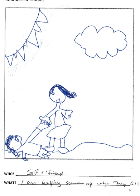
Figure 2. Drawing of students' perception of kindness in themselves (girl, third grade).