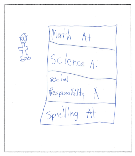
Step #2: Draw a picture that shows a teacher doing something kind. What might a teacher do to show kindness at school?

who? teacher lets me know how I'm doing in school It means I'm a good student and he cares about me well, my learning.