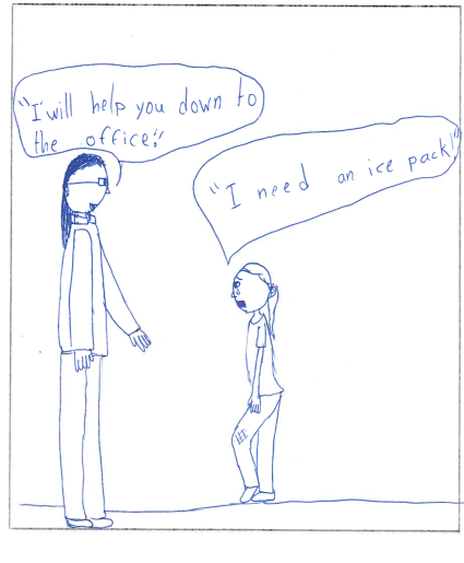
Step #2: Draw a picture that shows a teacher doing something kind. What might a teacher do to show kindness at school?

WHO? Self+ teacter WHAT? tunber helped me down to the office to grab anice pack because I hart my leg.