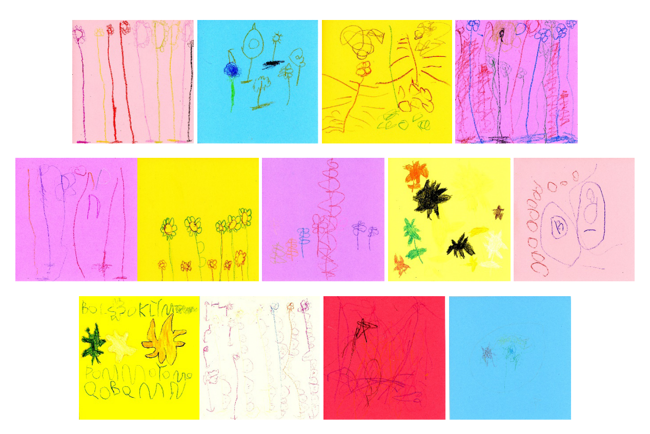
Figure 4 a-m (left to right, top to bottom). Images of flowers that children drew as a preliminary part of the process.

After discussing the artwork of Lee Mingwei with the children and preassessing what they knew about flowers, the children made drawings. The discussion of the artwork did not flow smoothly and was strongly guided by me. The art making, however, seemed to be more fluid for these children in comparison to the conversations. While the children made their drawings (see Figure 4), it gave me the opportunity to interact with each of them and document what they could share with me.