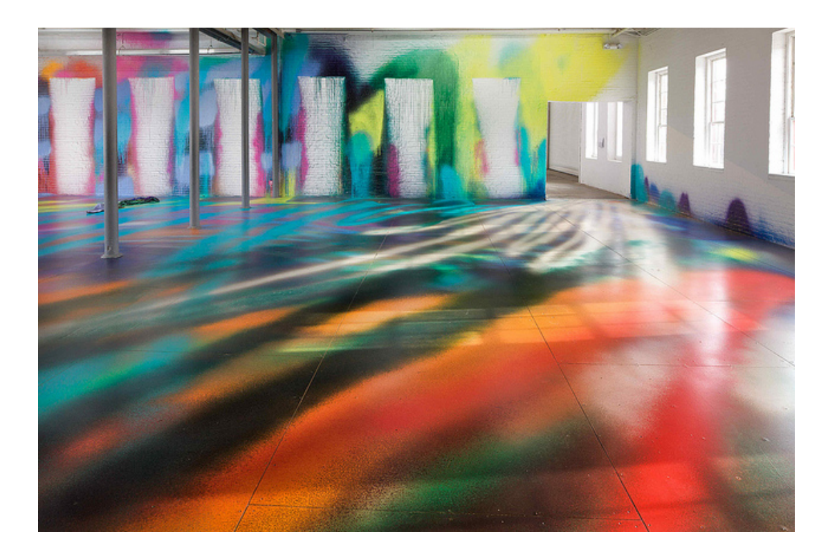
Figure 1. Katharina Grosse "One Floor Up More Highly" installation (2010). Source: Massachusetts Museum of Contemporary Art (2011a)

Grosse's work is known for a vibrant palette and large gestures. Her installations merge painting, sculpture, and architecture, and often take the form of painted interiors and exteriors of buildings. As noted on the Massachusetts Museum of Contemporary Art (MASS MoCA) website, Grosse uses a spray gun instead of a brush, painting directly on the walls, floors, and facades of her exhibition sites. Often, Grosse's installations incorporate a variety of unexpected objects that also get painted directly on and confuse the floor and ceiling. Her work seems like a flow of colours and rearranges conventions and habits of seeing. In a 2011 interview for Artforum 's website, Grosse discusses how her installations function as an expansion of small experiences, and she goes on to say that, by transforming something small into something large (her installations), the time and information are presented like slow motion ( Artforum , 2011). The blurry photographs made by the children in the focus class are metaphors for the moments and gestures of learning that are very small experiences; however, this research makes them larger, slowing down the information and giving the children time to reflect on this experience: How could we create an installation similar to Grosse's (see Figure 1) that slowed down time and enlarged a small experience?