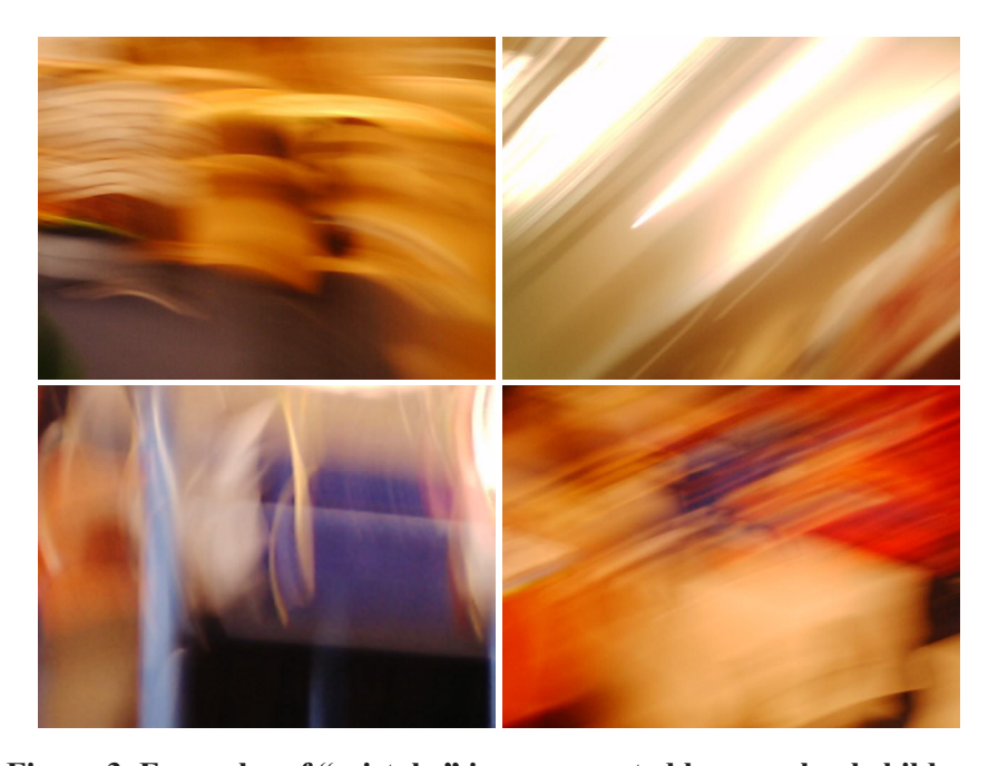
Figure 3. Examples of "mistake" images created by preschool children.

During the second session with this project, the children viewed their "mistake" images (throughout the previous sections these images were referred to as blurry, but in this section the term mistake is used because it was the term the children selected). Examples of the mistake images are shown in Figure 3.