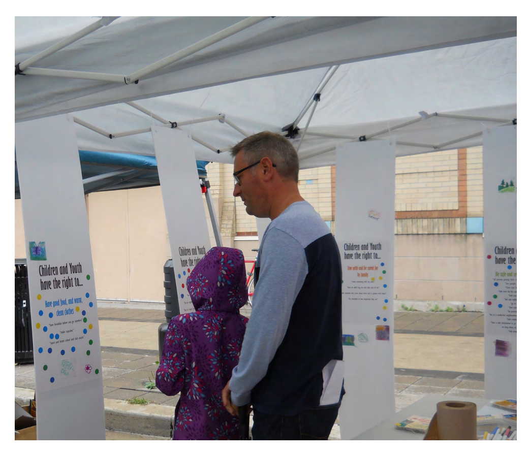
Figure 4. A parent and child consider the rights prior to the child's voting.