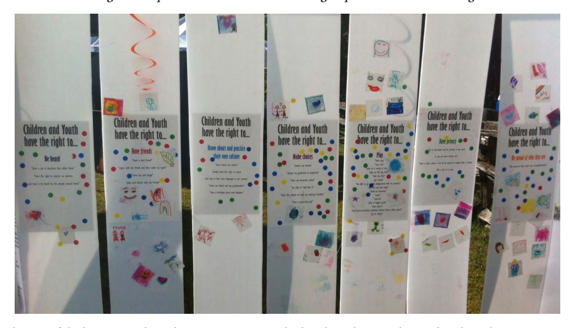
Figure 5. A selection of the banners early in the voting process, each already with many dots and stickers chosen or created by children to indicate what they thought were the most important things for all children to have or to be able to do.