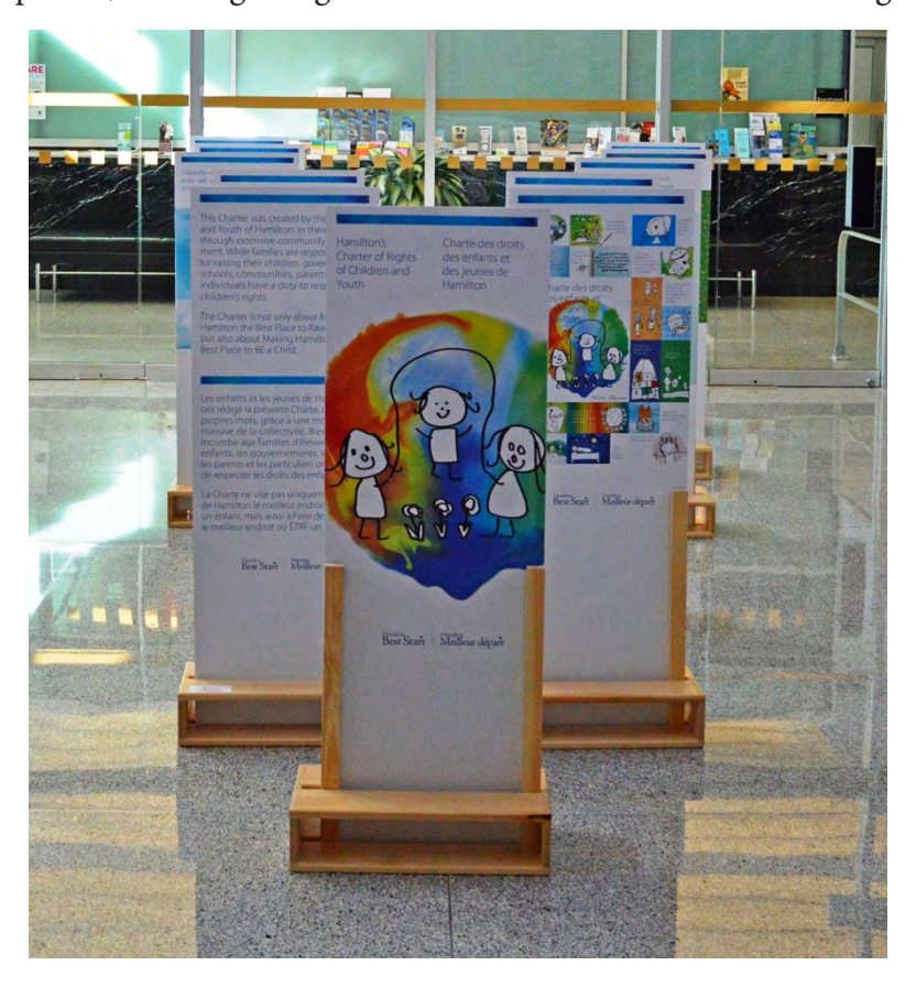
Figure 7. Panels on display at Hamilton City Hall.

We met our goal of having the charter published before Universal Children's Day, November 20, in the year that marked the 25<sup>th</sup> anniversary of Canada's signing of the UNCRC. To honour the city's endorsement of Hamilton's Charter of Rights of Children and Youth at a council meeting in November 2015, we created large replica pages of the charter for all to see (Figures 7 and 8). An exhibition intended to spark dialogue on rights and responsibilities was launched at Hamilton City Hall in November 2015. It included a large-scale sculpture constructed of a recycled airplane part, later affectionately referred to as "the wing," and staggered branches with suspended strands that held all 1,000 paper cranes, each inscribed with rights from children aged 6 to 12 years (see Figure 9). The youth component of the exhibition featured a collage of artwork and words from youth aged 13 to 18 years. This installation included submissions from teen parents. The three-dimensional nature of the exhibit invited people to walk among the panels and the cranes. The exhibit also featured the children's original work in two binders that visitors could look through. The exhibition toured to over ten civic centres, libraries, hospitals, and recreations centres over a 15-month period, reaching a large cross-section of audiences across the greater Hamilton region.