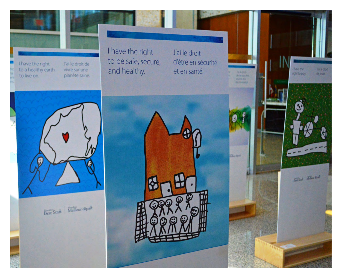
Figure 8. Close-up of panels in exhibit.