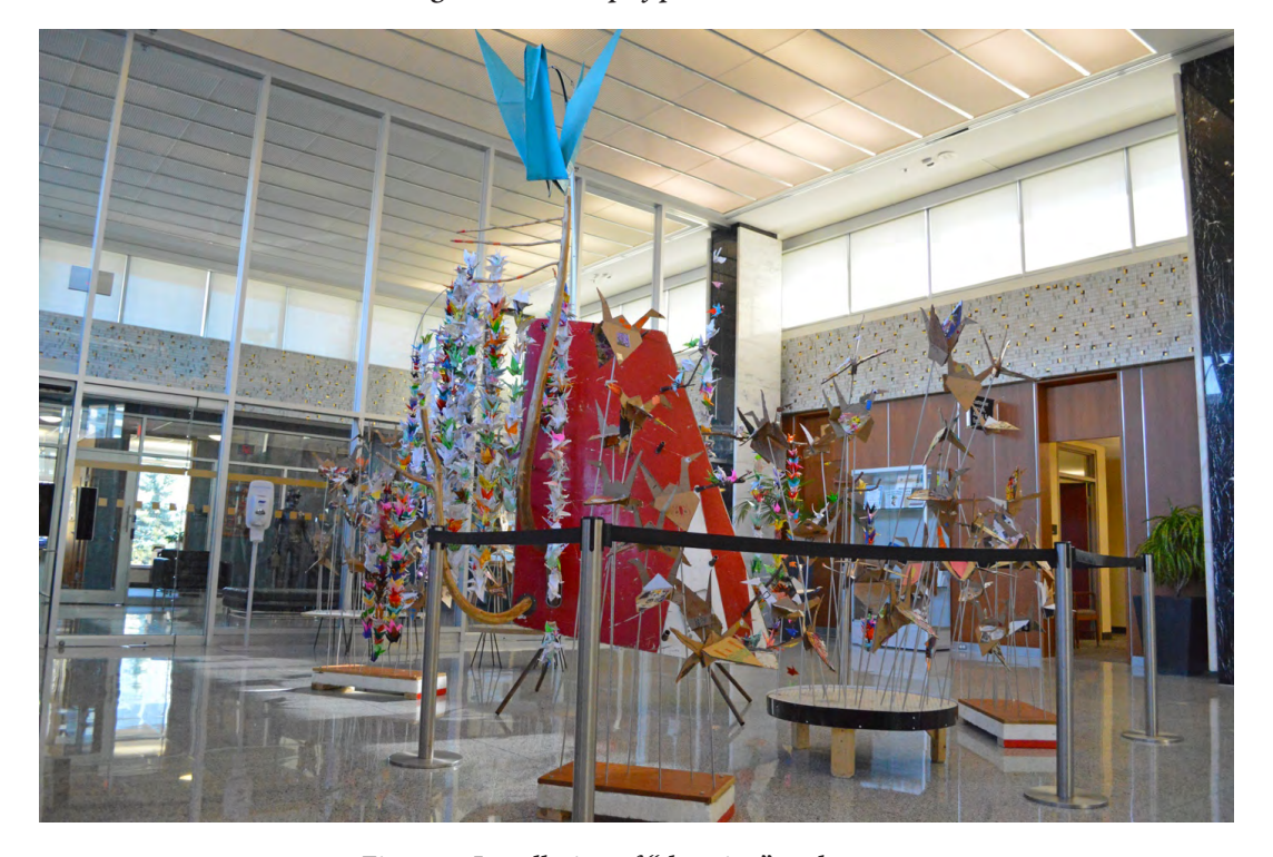
Figure 9. Installation of "the wing" and cranes.