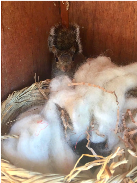
Figure 3. Tentative encounters.

These dichotomous perspectives about squirrels hold the same underlying premise: that squirrels come from nature and thus are alien to our urban environment. As beacons of the natural world, a pristine place far from the reach of humans, squirrels in urban settings are viewed as “the other”—either dangerous invaders or magical messengers of nature, depending on the context.