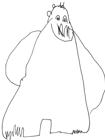
Once there was a tiny squirrel named PT. His mom went walking in the woods to find meat and she got eaten by a bear. Then the bear spitted her out but she was already died.