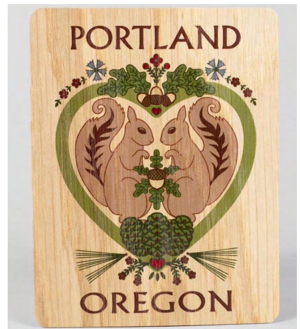
Figure 2. Storybook squirrel.

The complex identities/histories of squirrels in the Pacific Northwest are not unlike the complicated and entangled histories of some humans in this region. Depending on the context, squirrels have been regarded as docile and