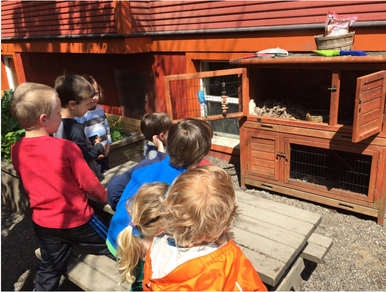
Figure 1. PT's hutch.