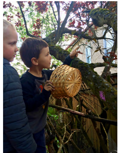
Figure 6. Child-made nest for PT.

As a longtime early childhood educator, anthropocentric child-centered pedagogies are intertwined in my thinking and practice with young children. I believe that in encounters with the rescue squirrel, the children also defaulted to this familiar anthropocentric paradigm. For instance, though the children had a sense of the squirrel's agentic nature, their desire to understand the squirrel's will expressed itself in anthropomorphic terms. Two children who "spoke squirrel" asked PT if he wanted to come out of the hutch, despite the dangers present in the yard. Communicating orally with the squirrel was the children's immediate way of acknowledging the presence of a sentient being.