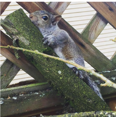
Figure 9. PT, the rescue squirrel.

Ketchabaw et al. (2015) note, “the places of discomfort are the places we need to learn from ... they are signals for us to pay attention” (p. 39)! Thus, we might consider attending to the disequilibrium we experience when we set aside our customary roles. 1