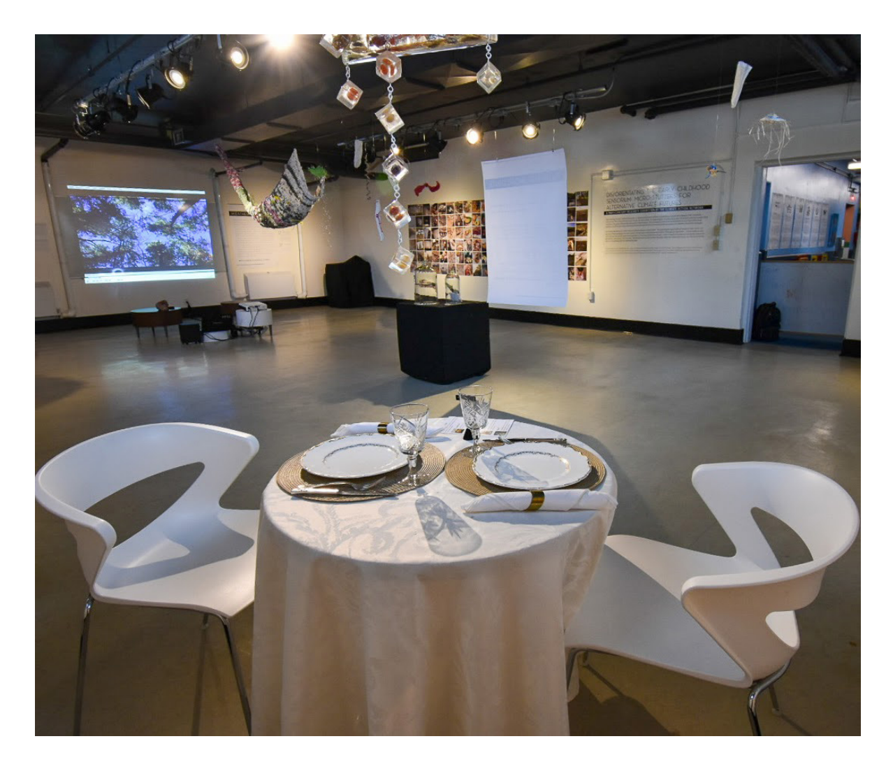
Figure 2. Setting the table.