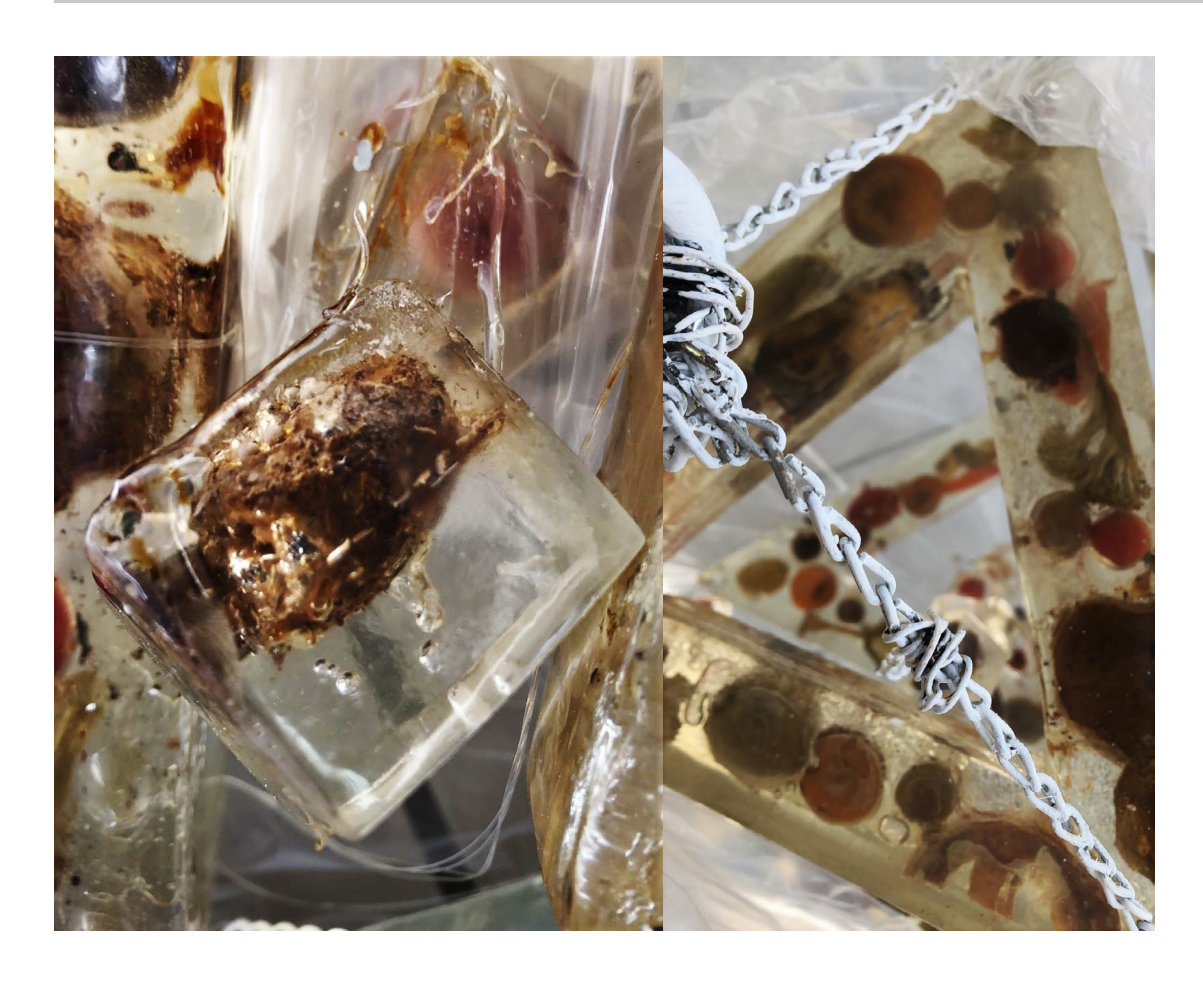
Figure 5. Untitled.

Plastic-wrapped in the basement, food-waste-resin stories live long after dinner. Tasting them now, displaced/ replaced across hemispheres—in and out of capitalist rhythms. Small chain-links move with unease—lethargic in the pull as syrupy insides drizzle through and across metal loops (Figure 5). Extending them long, small flakes of white, acrylic paint fall, sticking to fingertips and clinging under nails. The chandelier is slippery, sluggish as its accordion layers expand outward, sticky to what comes near. Still inside but leaking through, food-waste bodies are dissolving with each other and beyond the boundaries of resin skin. It is difficult to mark their forms. The view is blurry, rotting juice crystals tacked with mix-matched pieces of paper and plastic. Coming from the inside out. Residue lingers in mouth, the aftertaste is tart, the flavour uncertain. Bruises are slow to swallow. We percolate in this inhospitable moment when instinct calls to spit. How does climate catastrophe taste?