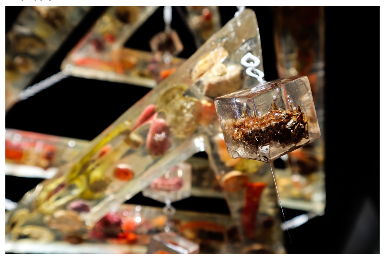
Figure 4. A liquifying chandelier.

The reality of this dining room is that there was no actual food served at the Exhibit. One of the focal pieces of the Exhibit, the food-waste chandelier centrepiece that consistently leaked from the inside out (Figure 4) and came crashing down twice during installation, posed relentless interruptions to set and reset our table. Revisiting the food-waste chandelier now, over two years since the Exhibit, we learn it has continued to decay, with the resin activating a syrupy mess. While we may have left the Exhibit on the very cusp of COVID-19, the Exhibit's mattering has not left us; the work of (de)composition keeps going. This consistency suggests the ongoing work and responsibility of the connoisseur to notice a world already tempered and "ticklish" in movement beyond human reason (Stengers, 2015), a connoisseur who works with multiple bodies and relational palates in which indigestion is the overt destabilizing reminder, offering bitter clues and more questions at a table we may not yet know.