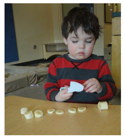
Figure 4. Cutting bananas.

"I began seeing their family life in their play—I didn't see those connections before"