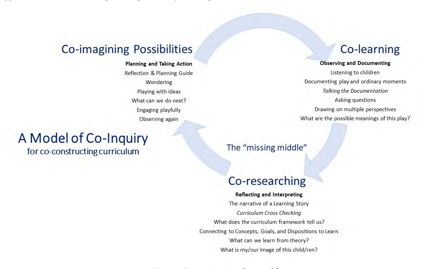
Figure 2. Co-inquiry: A working model.

The model, inspired by the work of Abramson (2012), is a flexible frame for emergent, organic, and nonlinear curriculum planning and meaning making. We draw on the notion of the "missing middle" in emergent curriculum planning (Stacey, 2009). Typically, educators observe for interests and plan next steps, often in the moment and without taking the time to reflect. Taking time to "muck about" in the middle has proven inspiring for researchers and educators alike. In this model, curriculum evolves from children's everyday experiences and relies on educators' skillful observation and close listening to what children are doing, or wanting to do. Educators are active, reflective, critical thinkers in this planning process. Figure 2 is a working model of the co-inquiry processes we are using to support curriculum meaning making with Play, Participation, and Possibilities .