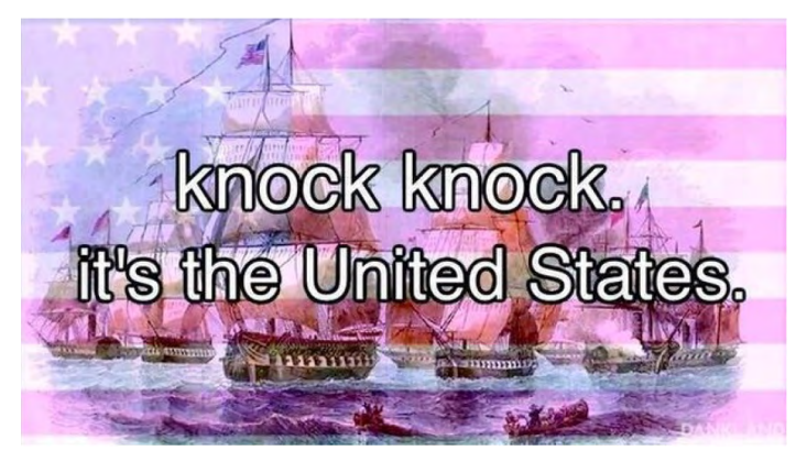
Figure 4. Knock knock. It's the United States.

Depending on the example in question, this community identification and recognition of shared experience may often involve identifying oneself with groups (like the LGBTQIA community) whose existence and visibility is clearly politicized, or discussing issues facing particular groups (such as stress and mental health among high school and postsecondary students) in a way that explicitly identifies a political, social, economic, or cultural problem. I have spoken with several users, for instance, whose first tentative steps out of the closet came in the form of sharing "obscure gay memes." In other cases, as with tag yourself memes that refer to media fandoms or activities like playing in an orchestra, the engagement with cultural politics may not be as obvious, yet there is still an element of the normalization and celebration of communities and ways of interacting that are misunderstood or maligned in wider society. The young people I spoke to ascribe clear importance to the existence of spaces in