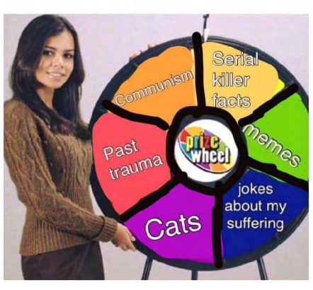
Figure 2. A "prize wheel" meme.

making and sharing memes like this by saying that seeing them collected on others' blogs was "like looking into the minds of people, rather than anything else." If the engagement with cultural politics is not immediately clear in examples such as these, which focus strongly on individual self-making, it is worth noting that self-representation can be as much a matter of resistance to outside expectations and perspectives as one of independent expression. As Buckingham (2008) asserts, "identity is not merely a matter of playful experimentation or 'personal growth': it is also about [...] life-or-death struggles for self-determination" (p. 1), often against significant social forces. Defining oneself through ways of communicating or in reference to ideas that are outside those preferred by mainstream society, in other words, is an act of cultural resistance because it involves pushing back against the inscription of dominant frames of