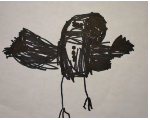
Figure 2. Raven with buttons.

It seemed most of the children shared the view that Raven was good