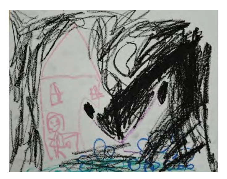
Figure 4. "Double-headed serpent came at night."

While some children drew the image of Sparrow's Double-Headed Serpent Post, others drew a "double-headed serpent and a Musqueam person" or the house in which the Musqueam people hid.