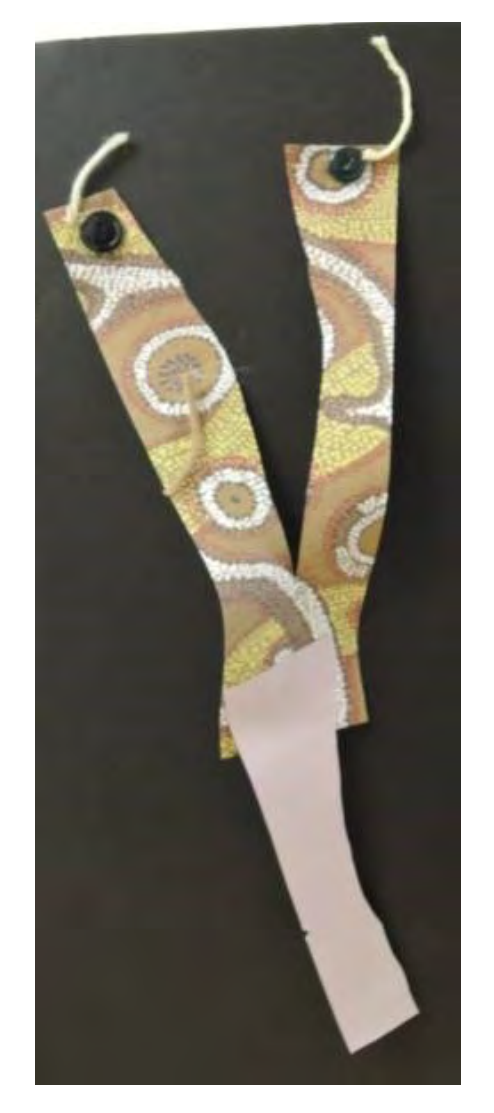
Figure 7. The double-headed serpent with tongues.

I wondered what the children would think of the perspectives of the Musqueam Elder. I decided to share them by bringing back the conversation of "being scared." I retold the serpent story once again and revisited the children's first impression of the double-headed serpent as scary. After three