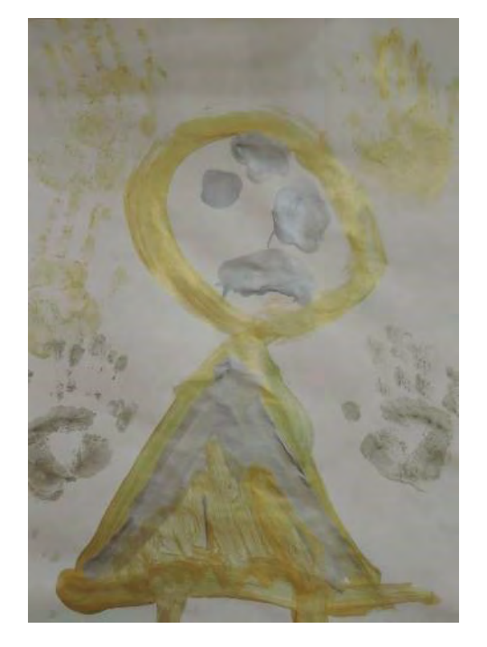
Figure 1. Sky Chief's daughter. "She is sad because the baby was gone and the raven was away."

they would interpret the story. Contrary to my expectation and desire to "get it right," the children's discussion showed multiple understandings of the story. The exchange of different views was genuine, and the children listened to each other carefully and shared their ideas seriously, allowing themselves to see diverse and complex interpretations of the story. One child's painting demonstrated another possible interpretation. She saw the story through Sky Chief's daughter's eyes and made meaning of it. She explained, "She is sad because the baby was gone and the raven was away." Her deep understanding of attachment between a child and his mother astonished us.