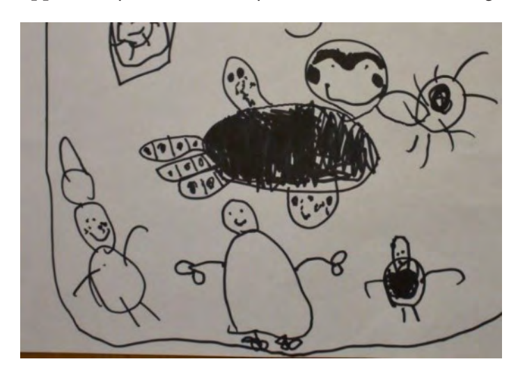
Figure 3. The bentwood box with the sun inside. Raven with the sun in his beak. Chief, his daughter, and the raven child.

to bring the light to people. Some children drew all the main characters: Raven, Sky Chief and his daughter. We also noticed some children took time to depict each scene as they drew. The process of drawing itself became an opportunity to tell the story, and some of the drawings started to represent the sequence of the events.