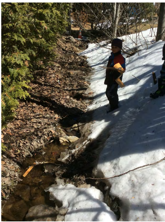
Figure 2. The children follow water in the playground and the creek behind the school.

Our experience of place—and with our following of questions, following paths, and taking nature's lead—is that a dialogue with place is distinctly relevant to our location, and that "meeting in the forest" that is education is important for the child, the educators, and the land itself.