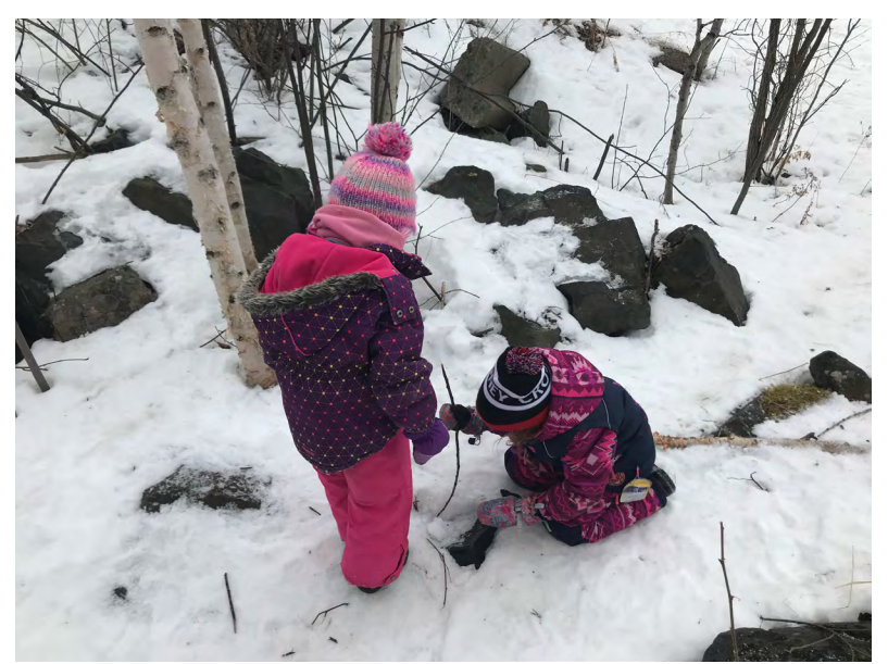
Figure 1. Using a stick, Zoe tries to pry a discarded container from the ice.

On a winter day, Zoe discovers a plastic container buried in the snow and tries to pull it out. Her friends join in and they try different ways to move it, pushing, stamping on it, and using a stick to try to pry it loose, with no result. As the others drift away, Zoe persists. "I would do anything to save Mother Earth," she exclaims.