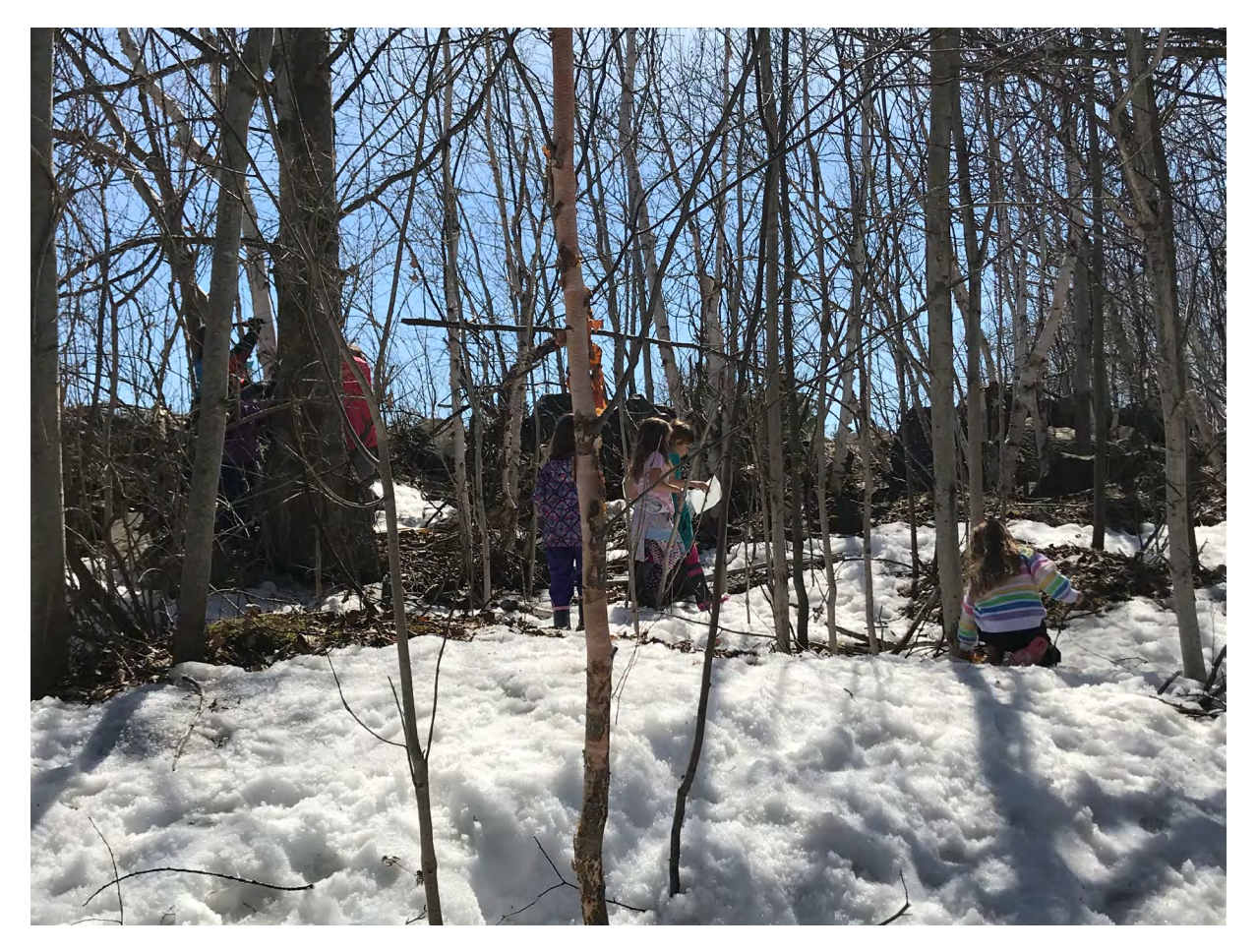
Figure 6. In the bush we see a different child.