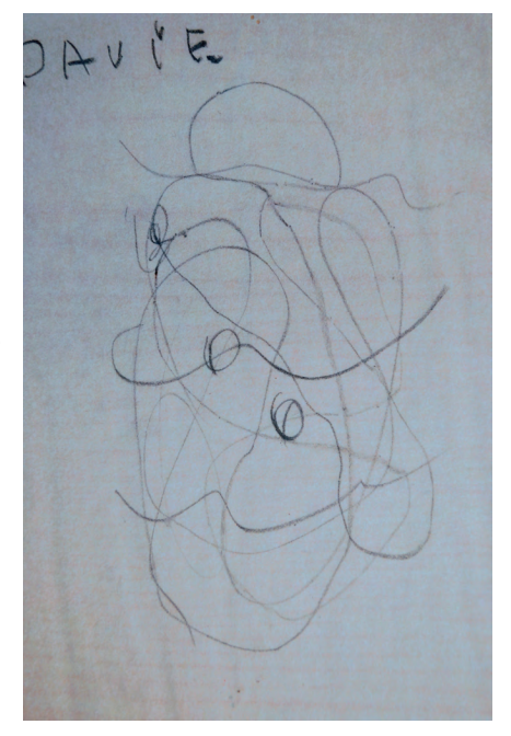
Figure 4. Observational drawing of melted ice by Davie.

In the children's drawings, we observe their deep observation and their listening to this encounter with water. The image (above, left) is a representation of a frozen tire the children found encased in ice. Back in the classroom, this piece of garbage serves as a catalyst for Finn to imagine a machine that can make clouds. He reconceptualizes the tire on the paper and with materials in a three-dimensional form. He does not see the tire as debris but rather as an opportunity for reconsidering its purpose.