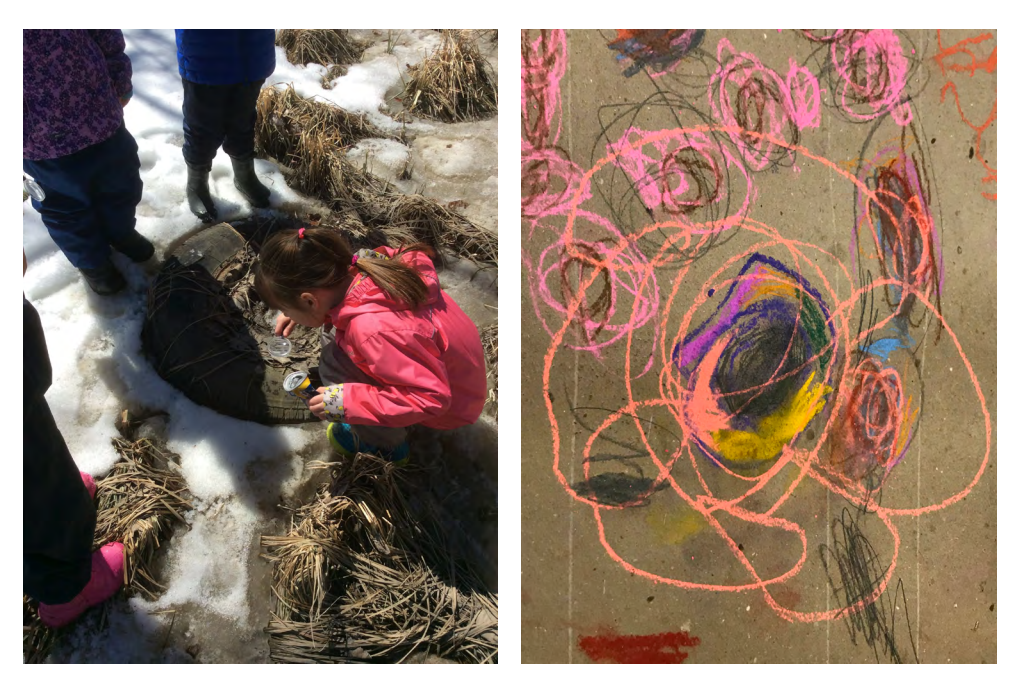
Figure 5. Left, a frozen tire encased in ice found by the children; right, collaborative drawing of same.