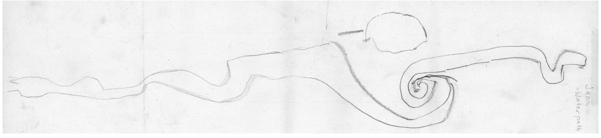
Figure 9. Water pathways on the ground, by Davie and Jana.