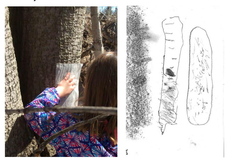
Figure 8. Bark rubbing (left) and bark drawings (right) by Zoe. Where does water go? How does it get to the leaves? Does water move through wood?