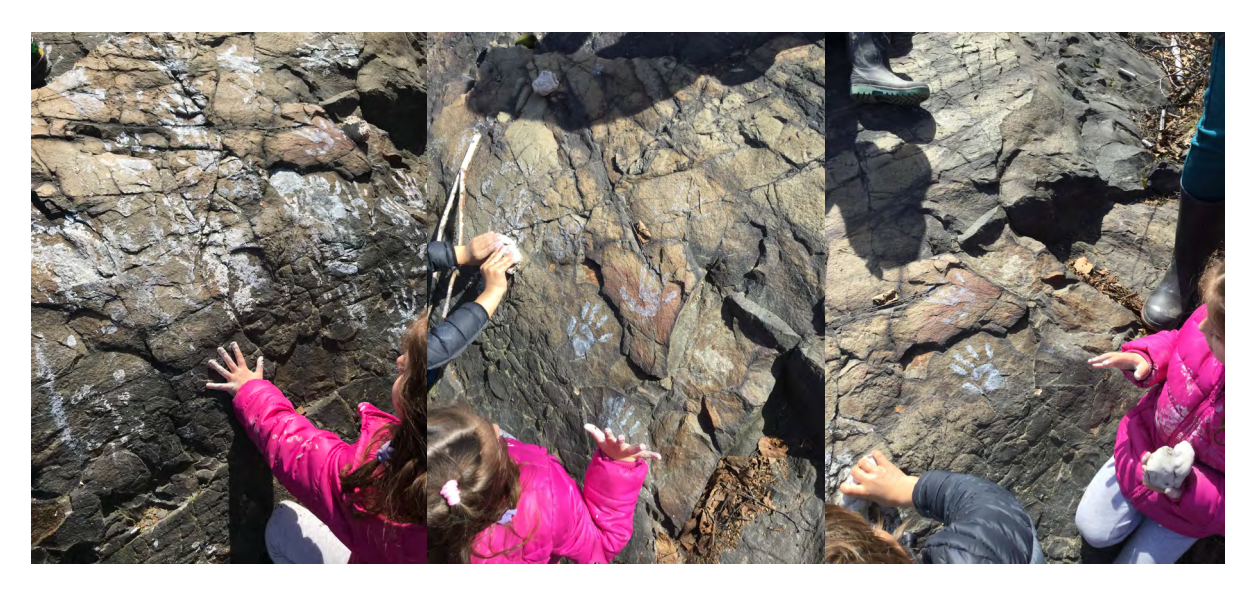
Figure 10. Hand, clay, and water pathways—impressions on rock.

It's making a pathway in the rocks, it goes through the cracks. (Kale)