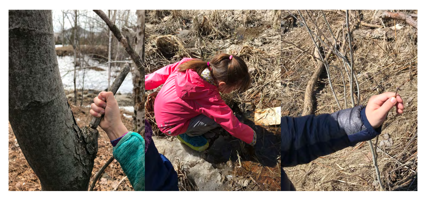
Figure 7. The children slow down, pause, touch, consider, lean into nature.

In the bush, we see a different child from the child indoors, from the child on the playground; here the children's movements slow down. They pause, touch, consider ... they lean into nature. The trees become the means by which they can walk up the steep hill, the rocks a pathway to get across the creek. They follow the contours of the land and learn from it through this following. In the schoolyard the built environment directs our feet, but in the bush the land leads us. Feet follow river pathways; they balance on chunks of ice. We see hands that hold, that touch, fingers that point, that track, that draw, that outline the way the water goes. Sophie encourages this embodied listening by asking the children to draw what they notice. To follow the pathways. Touch the bark. Smell the buds. Gilles Deleuze (1994, as cited in Dahlberg & Moss, 2004) put it this way: "Thought is what confronts us from outside, unexpectedly. Something in the world forces us to think. This something is an object not of recognition but of fundamental encounter" (p. 114).