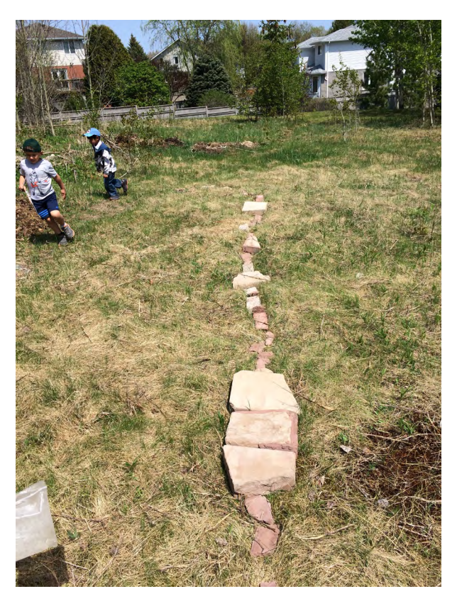
Figure 13. The children reimagine debris as a new paving stone pathway.

Toward the end of the year, the children gather broken paving stones they have found partially buried and lay them one in front of the other. They begin to make a new pathway, one that follows a trail created by animals. We wonder, where will this pathway lead us?