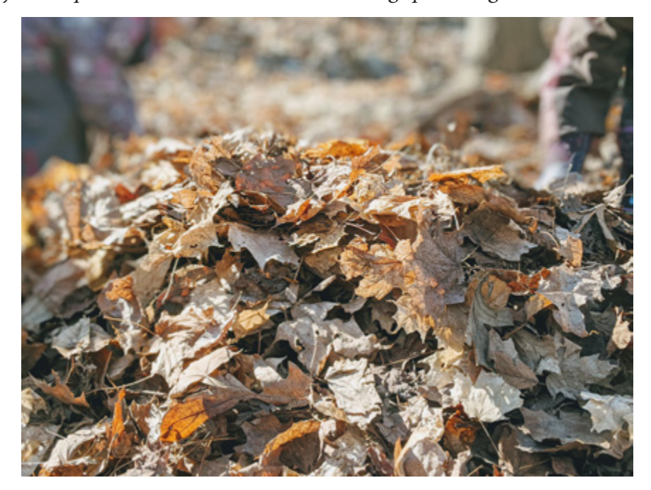
Figure 10. Squirrel under the leaves.

On another late winter day, we enter the forest with the swishing of snow pants and the clunking of winter boot heels dragging across the concrete sidewalk. "The squirrel is still died!" shouts a boy. The children stumbled upon this dead squirrel on the previous day. They find it again easily because they'd marked the spot with a discarded fluorescent orange plastic lid. Despite the frigid temperatures, the squirrel's body has further decomposed and is now covered with bugs. One child worries that the squirrel is "sad and missing his family." Another suggests that he was "asleep for a long, long day." They agree that he needs to be covered in a warm blanket of fallen leaves. The leaves are gathered and carefully placed. Everyone is quiet as the bed is marked with a large pine bough laid across the top.