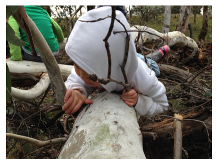
Figure 7. Lying on tummies.