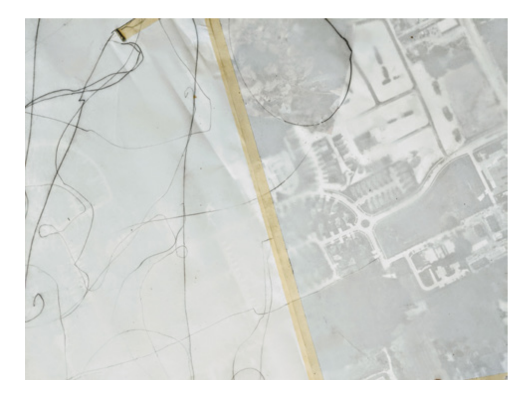
Figure 11. Mapping and tracing in the classroom.

The preceding vignettes offer a view into a common worlding pedagogy that maps children's speculative stories of everyday place encounters. Like our Australian colleagues, we did not plan or stage these encounters. They emerged when children's movements unexpectedly intersected with those of others—with living settler colonial histories, remnants of previous agricultural land use, suburban gardening practices, and debris, and with stories of loss and discovery, death, decomposition, and care. The mapping work inside the classroom reverberates with the same rhythm as our walks. It emphasizes points of view attuned to small stories of difference which have the potential to make a difference (see Le Guin, 1986/2020). Our common worlding speculative mapping does not illustrate place. It unfolds both alongside and within place, and alongside and within our own bodies, when we walk, touch, speak, imagine, speculate. Unlike the satellite map we reinscribed, our mapping vantage point is not the lofty, totalizing "view from above" looking down with authority that Donna Haraway (1988, 2008, 2016) rails against. Rather, our mapping is embedded in the real-life grounds of place, and the children's view is an immersive one—looking around, looking out, looking in, and looking up. The pedagogical compositions of walking and speculative mapping practices are thus intensely attuned with intimate entanglements of human and more-thanhuman forces, facts, imaginings, histories, and futures.