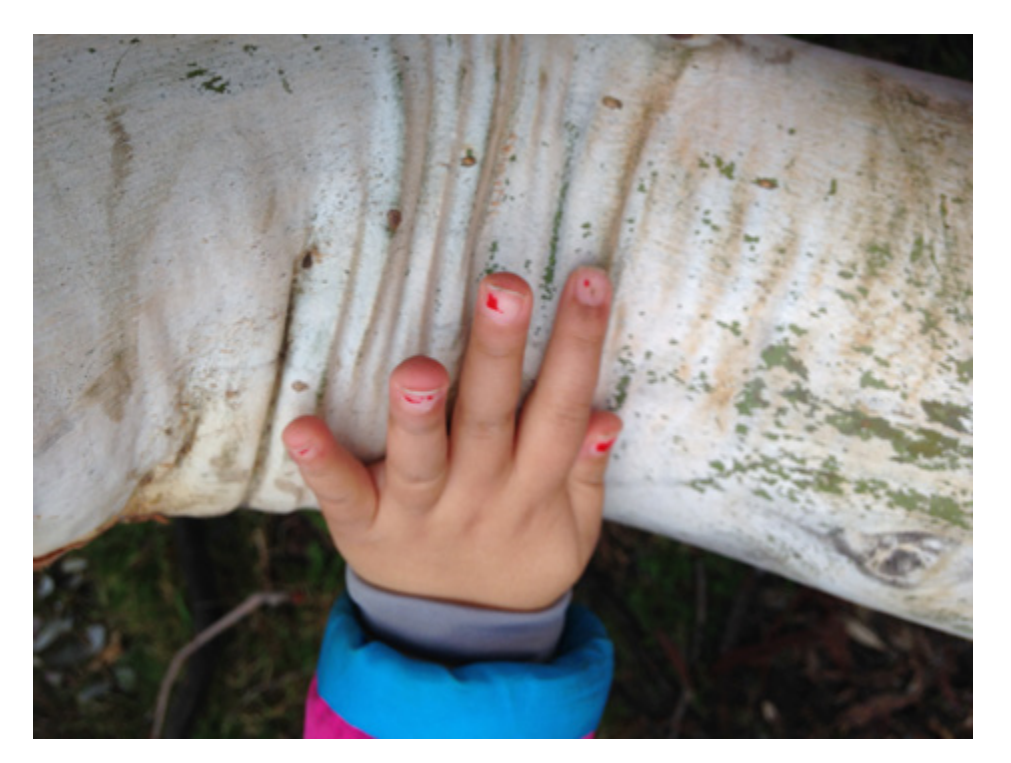
Figure 5. Feeling the wrinkled elbow.