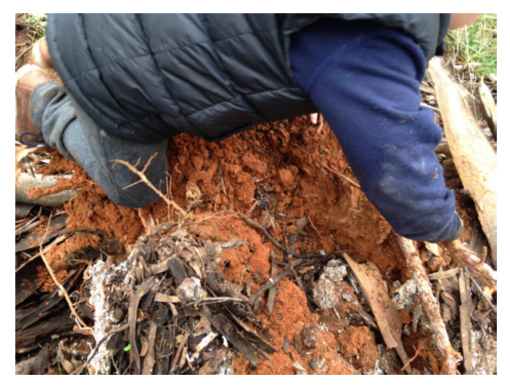
Figure 4. Inspecting the exposed roots.