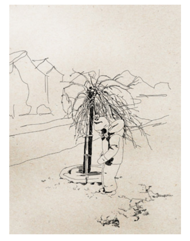
Figure 8. Banana Tree sketch.