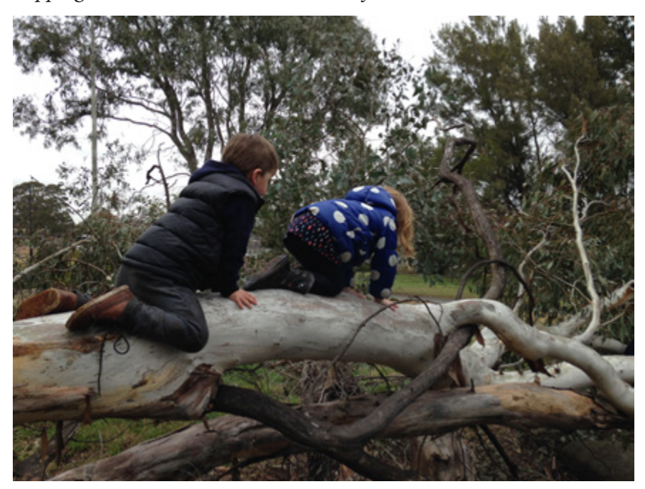
Figure 3. Inspecting the mangled branches.

After a moment of reflection, the children swarmed over the fallen trees (see Figure 2). Everything was at eye level so there was much to see. They inspected the mangled branches (see Figure 3), the exposed roots (see Figure 4), the crumbling bark and soil, the wrinkled elbows on the trunks (see Figure 5), the marks and bugs on the leaves. It didn't take long before they were wrapping their own limbs around those of the entwined trees.