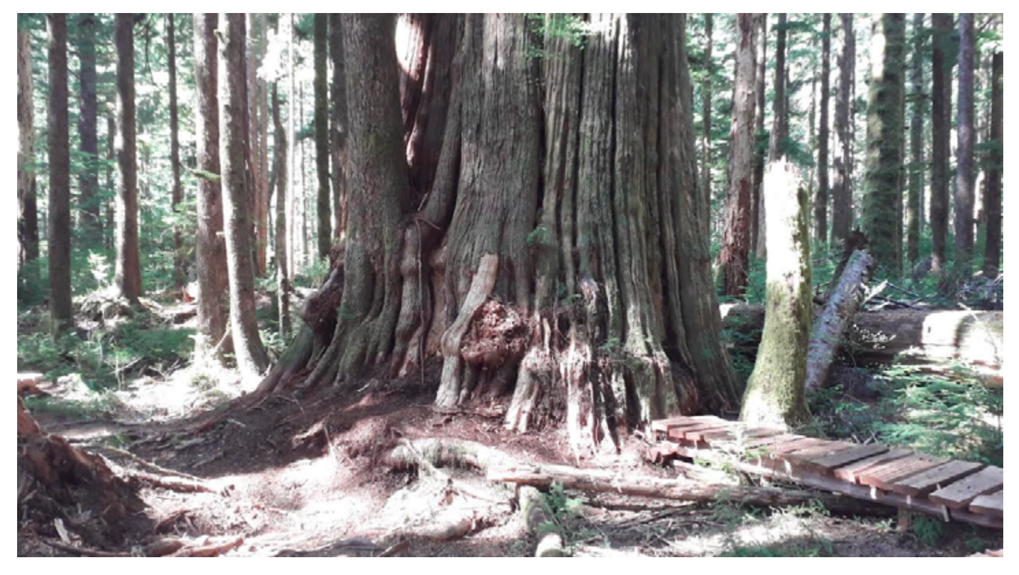
Figure 5. Meeting "Grandmother Cedar" on a interpretive walk at Fairy Creek.

As a group, we talked about the animacy and liveliness of Air without dismissing the complexities of living and breathing in settler-colonial atmospheres. With this in mind, we wondered together about loss and extinction. We discussed not only the extinction of more-than-human species but also the profound resiliency of Indigenous