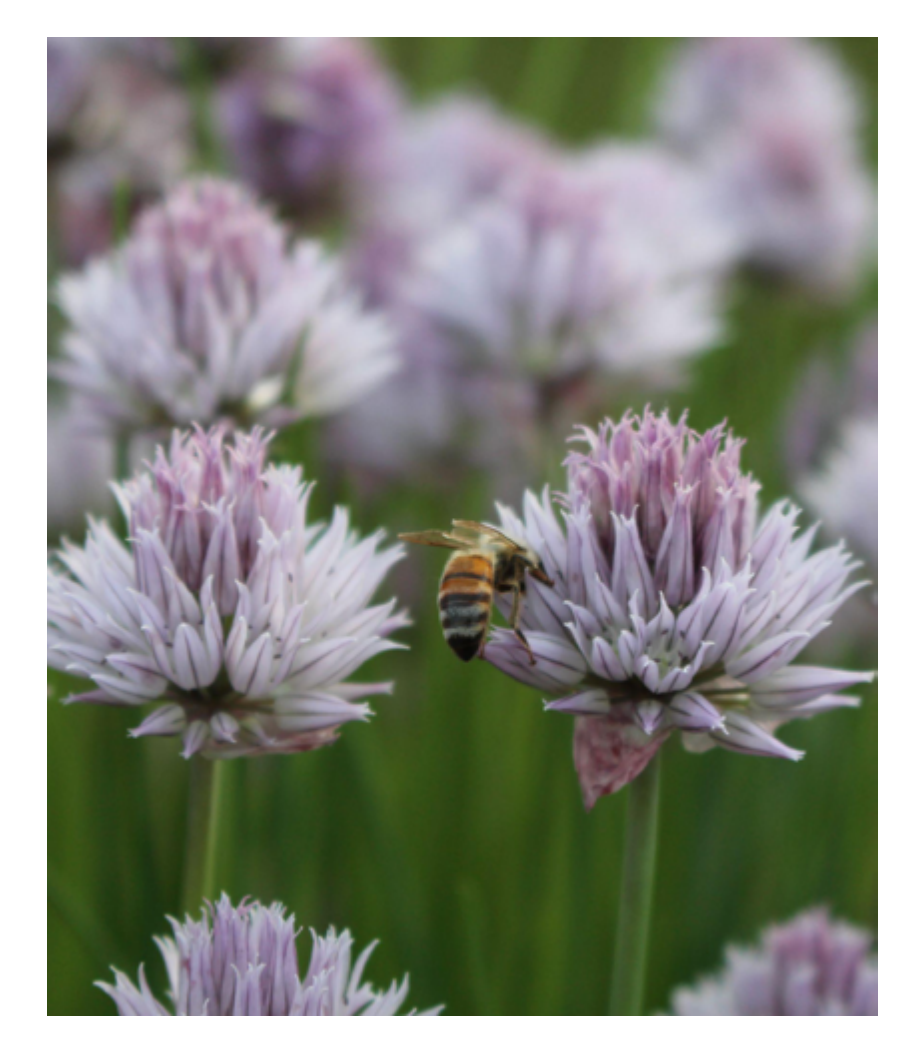
Figure 7. Honeybee pollinator in a garden in Grande Prairie, Alberta.