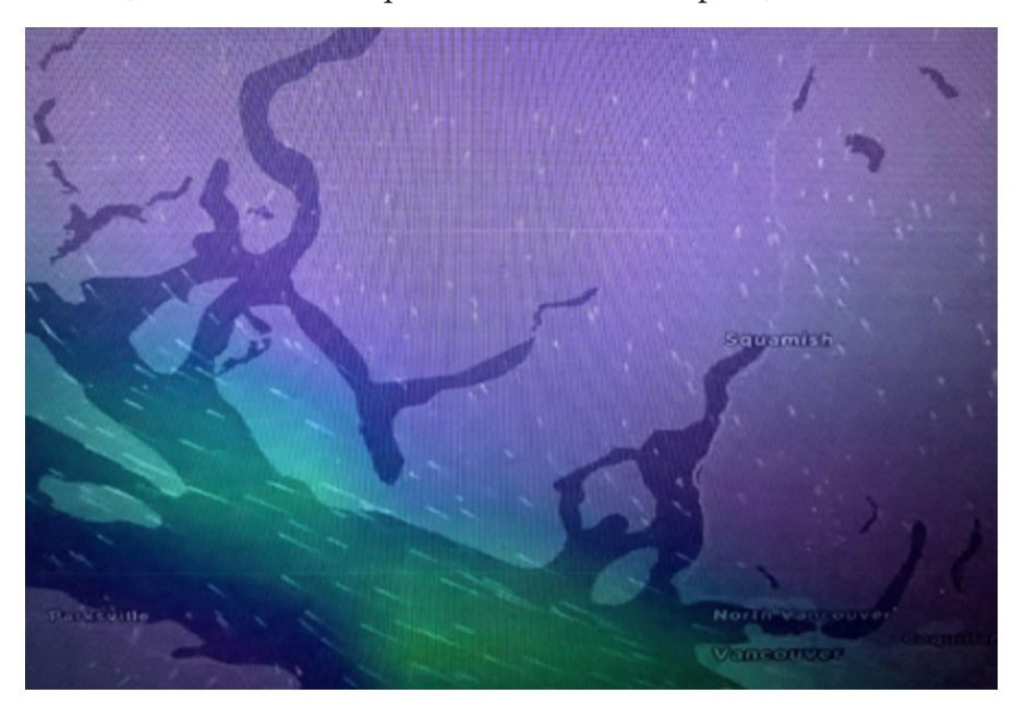
Figure 4. Ever-moving air system: Squamish.

We are constantly encountering Air, starting with the first breath we take. However, it is not just the Air we breathe but also the atmospheres we are creating that we need to attend to. Current times showcase the complicated and "damaged worlds" in which we live (Kummen et al., 2020). As human beings we are cocreators of these worlds, and yet we feel helpless in the face of what we have created (Latour, 2019). Humans and more-than-humans are always in a state of becoming-with (Haraway, 2016), and in our encounters, we are accountable for these becomings (Rautio, 2013), to decenter ourselves and tend to relationships with an "infinite responsibility for the other" (Levinas, 1979, as quoted in Biesta, 2006, p. 50).