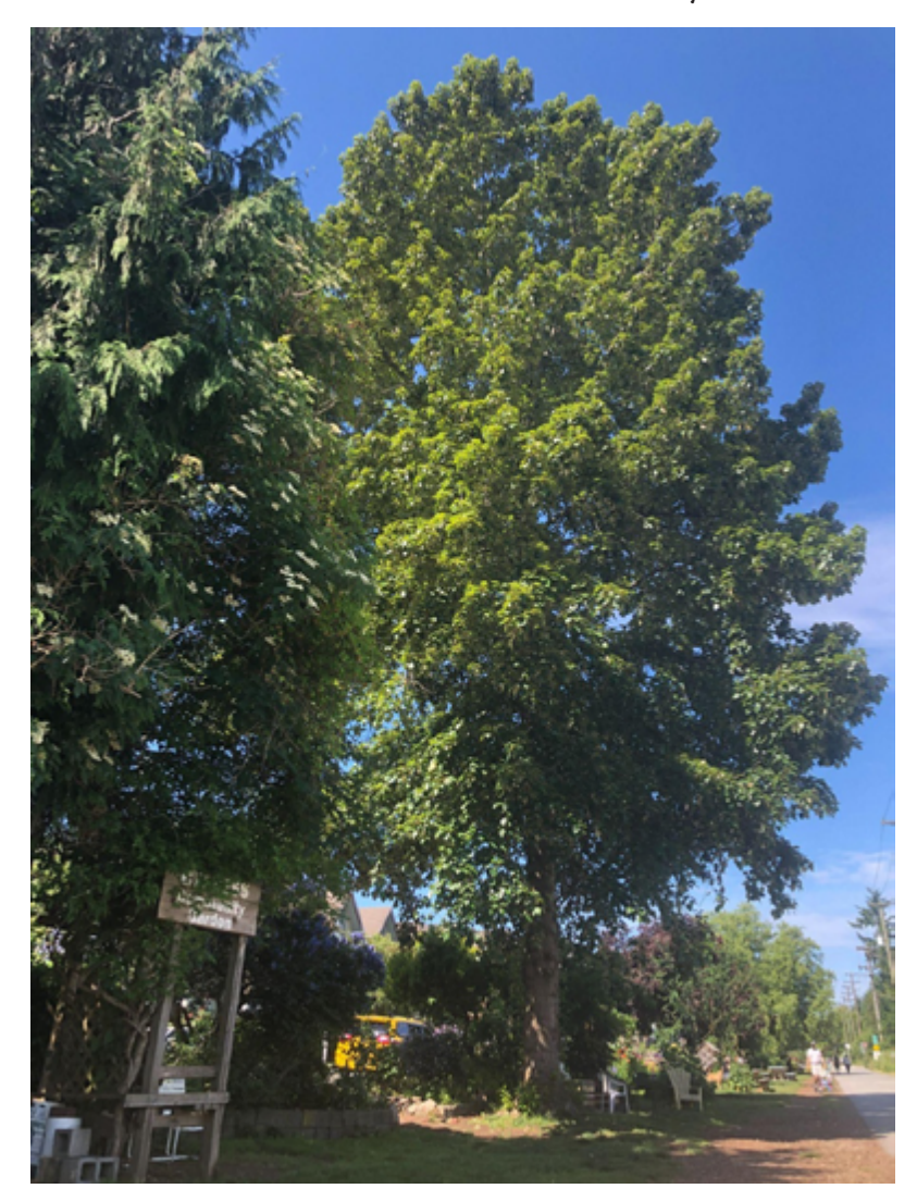
Figure 3. Old Katsura.

breezes flow through and along the edges of a modernized footpath, now referred to in settler terms as the Arbutus Greenway, which is situated on unceded traditional Squamish Nation territory. Windy gusts returning from the coastline may remember this place specifically as Senäkw. Drifts continue, dancing into the leaves of the largest tree along this stretch of paved pathway, a flickering between familiar friends. For a moment, the urbanized ecotone, where more-than-human bodies and beings bump up against 21<sup>st</sup>-century technologies, seems secondary to the rustling excitement of element and entity. In a shared scenic language and a gesture of reciprocity, old Katsura tree carries wind, absorbing an elusive body into shivering blurs of sage. Shades of green and shadows flutter together, making their merging movements audible as leaves turn into starlings and breeze becomes a murmur. Old Katsura tree lived here long before any carefully tended tulips or neatly assembled lines of sweet peas spiralled up trellises of plastic threads cultivated by human hands. A brief conversation between boughs and breeze seems to shift from a warm welcome to a shared and somber "unspoken" understanding. For there are few remaining here, amid the "conditions of settler colonialism" (Simmons, 2017, p. 5), that have witnessed the extreme excavations and enforced evolution of this "hu-man-made" ecosystem.