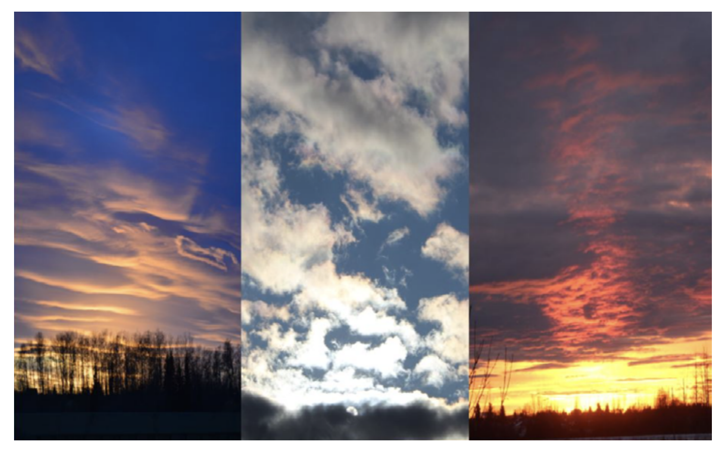
Figure 10. Glimpses of colliding cloud formations.