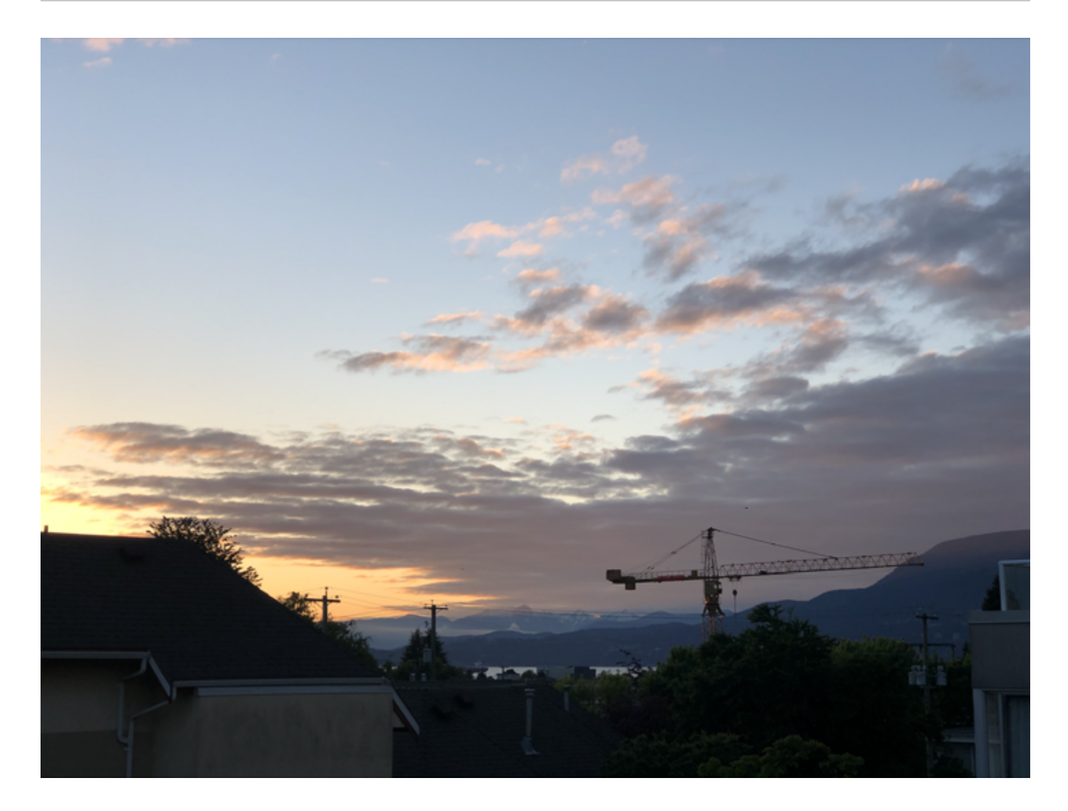
Figure 1. Clouded.

With an orientation toward enlivening Air in such a way that provokes us to listen more closely to the silenced, the invisible, and the otherwise, we were led into atmospheric tensions that encompass the contextual lifeworlds we are among. This provoked us to make intentional and ethical choices about what we chose to write about and why. Through these decisions, Air's being is expressed as an unpredictable element and embodied storyteller, leaving us most often with more questions than answers, more possible outcomes than endings, and a humble stillness of appreciation despite our swirling and often scattered thoughts.