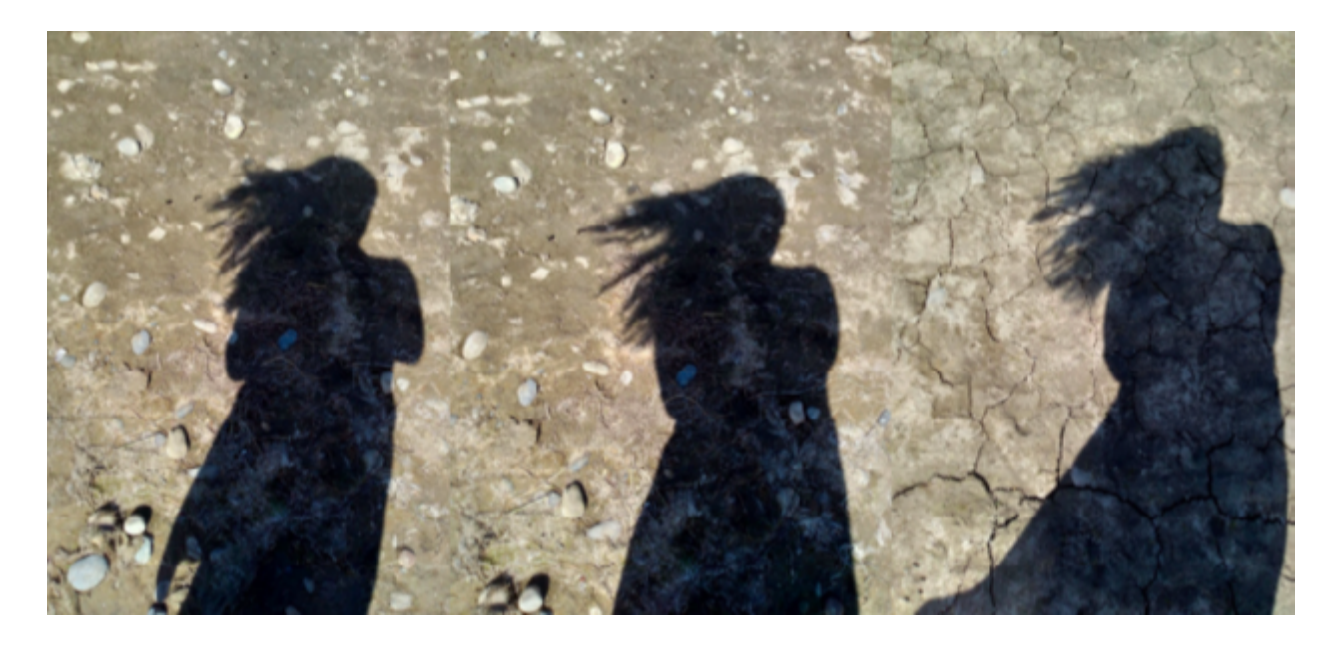
Figure 9. Surrendering to Air murmurs.