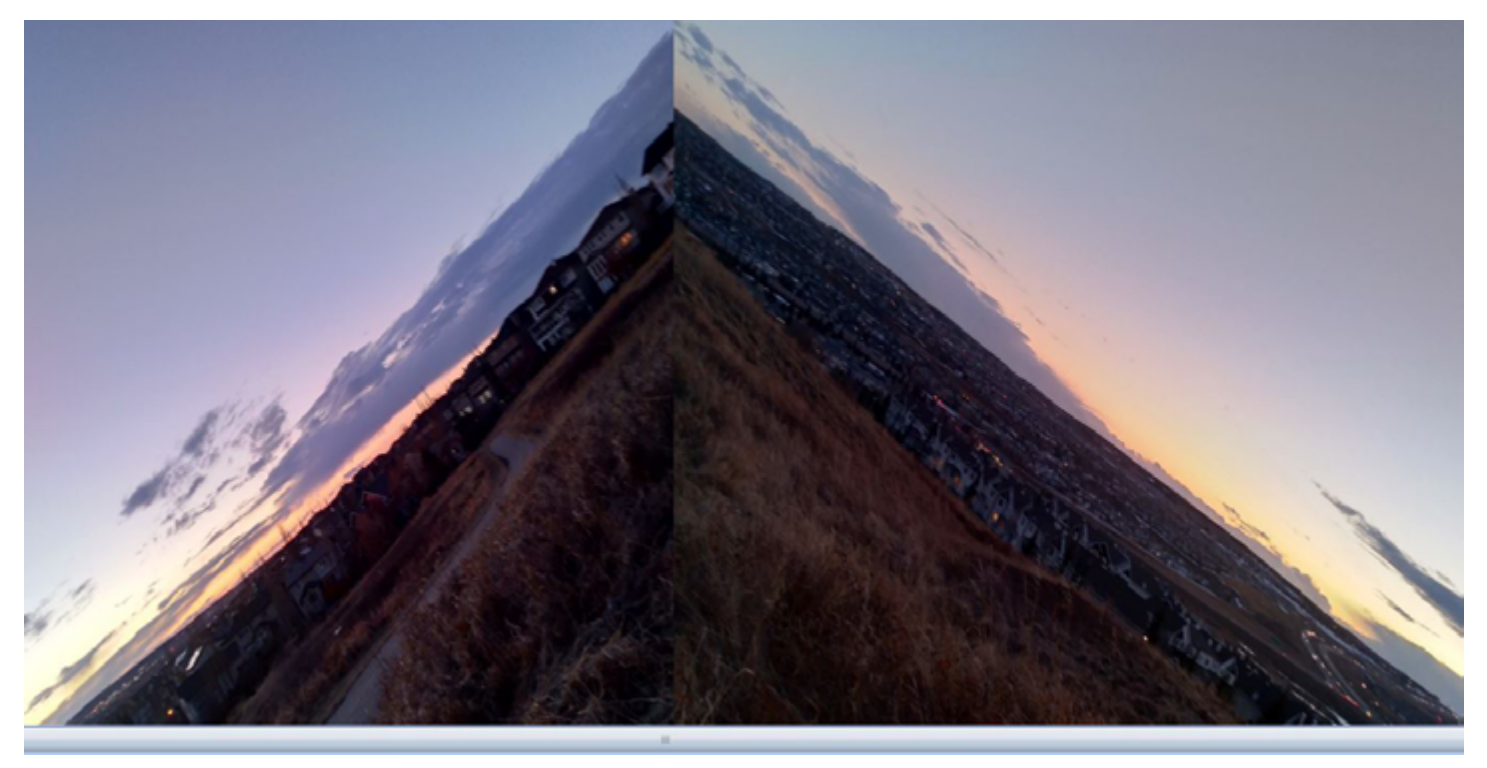
Figure 8. Atmospheric disruptions.

In a hidden pond in the park, Air feels cool and moist, and a particular smell of pine trees aromatizes the area. Plants with various verdant hues gather together in a place where lives meet. Resting on pebbles under sunlight rays, a vibrant yellow butterfly moves its wings delicately, resembling the rhythmic breathing of existence. Wind interacts playfully with white puffballs, and dandelion seeds slowly fly and float suspended up to several kilometres away with an itinerant movement. As Air travels, what other stories might Air have to shaire?