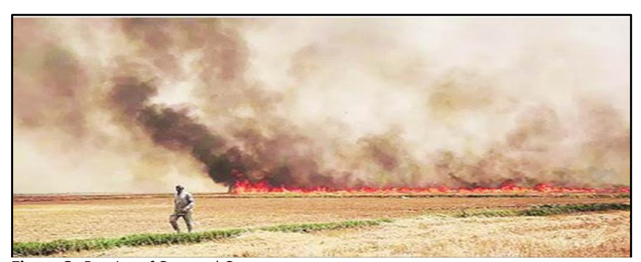
Figure 3: Burning of Seasonal Crops

Many sources are causing to produce air disaster smog. For example, Seasonal burning (See figure 3) of Triticum aestivum / Wheat and paddy crops. Agrarian, industrial and largest vehicles holding countries are major stakeholders in the world to produce smog.