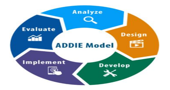
Figure 1. The ADDIE Model