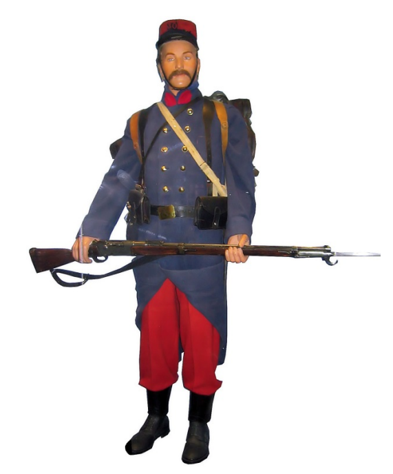
Figure 1. French infantry soldier in battle dress, 1914.

Especially the red trousers give rise to concern. They make the soldier a well visible target. (At least the red cap got a blue coating when the French army went to war, showing a certain concern about the inappropriateness of the uniform.) As Tardi (2013) writes,