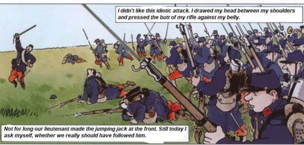
Figure 3. French infantry prepares for an assault on the German lines. – And below it is shown, how it ended.

the victorious time of Napoleon Bonaparte ended with Napoleon's defeat, the great reputation of the French army remained untouched. Hence, the defeat of 1870/71 was an unexpected catastrophe for the French generals. Soldiers and politicians were usually keen on honour and reputation, and thus the defeat of 1870/71 greatly affected the self-esteem of the French generals and not only of them. What could be done? Well, a good method to repair a wounded self-esteem is to deny the insult! Has the defeat of 1870/71 and in the Franco-Prussian war anything to do with the abilities of the French army? Not at all.