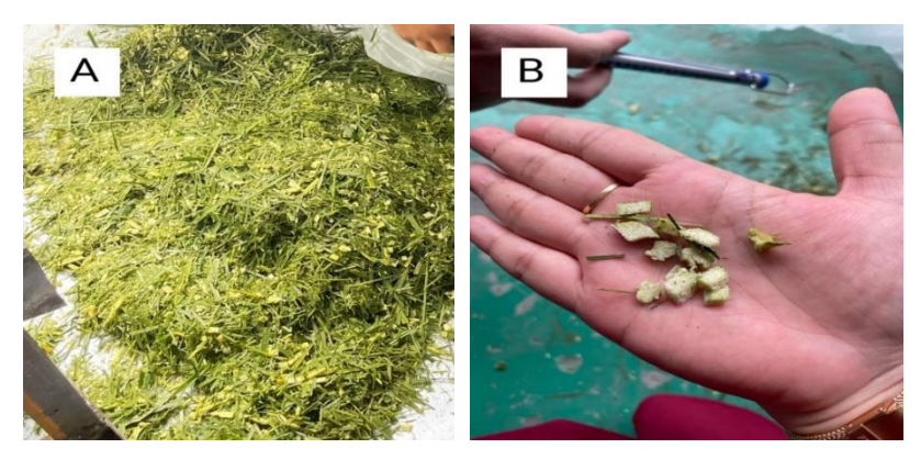
Figure 4. Chopped oil palm leaves

The results of the chopped palm fronds and leaves can be seen in the picture.