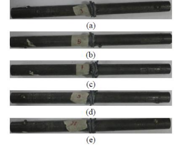
Figure 3.1 Joint of Friction Welding Process

The picture below is a joints form after being friction welded within 50 seconds, speed 1800 rpm and using length variant of chamfer. Here is the length variant of chamfer: