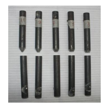
Figure 2.2 Specimen before Welding Run

Beside preparing the required tools for the research, the next step is adjusting lathe with speed 1800 rpm, time 50 seconds, load 3.5 kg to easier to adjust the load height in order to both surfaces can connect each other and it is able to start the friction welding process.