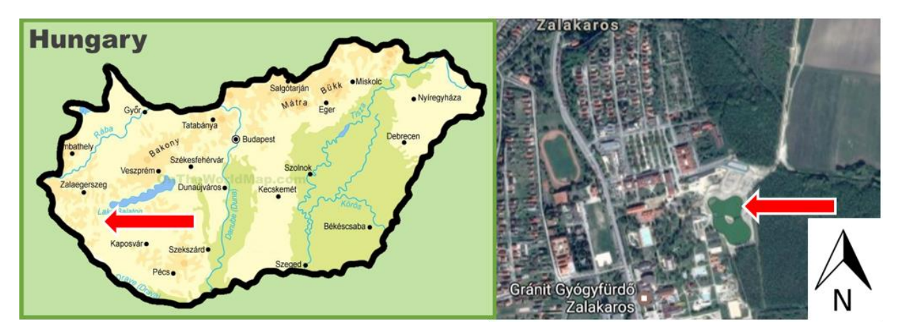
Fig. 1 Location of the study area

The main danger in this lake is the planktonic eutrophication because the algae can prohibit the growth of the macophytes planted in the lake. That is why chlorophyl-a concentration was a dominant water quality parameter that was also measured several times in a year in an accredited laboratory. According to the OECD scales (OECD, 1982) if the chlorophyl-a yearly maximum concentration is between 2.5-8 \text{ mg/m}^3 than the lake is oligotrophic. 8-25 \text{ mg/m}^3 is the mesotrophic range, 25-75 mg/m<sup>3</sup> is the eutrophic one and >75 mg/m<sup>3</sup> is the hypertrophic limit. The hypertrophic status can be dangerous for macrophytes and aerobe heterotrophic organisms living in the lake. The high primary production of the phytoplankton can cause very high oxygen level in daytime but oxygen depletion and fish kills in early morning.