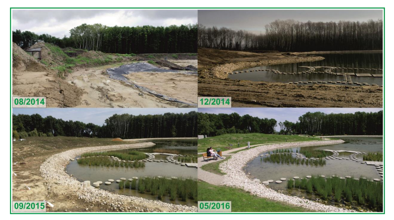
Fig. 2 Formation of the lake bed and the planned macrophyte plantings at the shallow area of the lake (near the "flagstones")

Amongst the plant nutrients, the concentration of the absorbable nitrogen forms was constantly low according to the samplings: the concentration of nitrite and nitrate was usually under the measuring range, and the concentration of ammonium was low as well, not contributing to algae growth. The concentration of phosphorous forms was similarly low, under the measuring range. In the water of the bath the concentration of these nutrients was very low, those that were still present were immediately absorbed by the algae in the lake. As per our opinion, the main nutrient sources were primarily the sand layer covering the lake, secondary the atmospheric drift (dust).