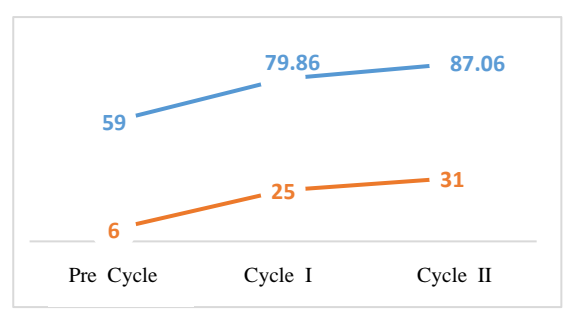
Figure 2. Improving of Student Learning Outcomes

This Classroom Action Research (CAR) was carried out in order to improve the quality of cognitive learning outcomes and honest attitude of class VIII H SMP 5 Semarang through the application of discovery learning models. This classroom action research was carried out in two cycles and each cycle consisted of two meetings. Based on observation data in class VIII H of SMP 5 Semarang, it shows that before the action (pre-