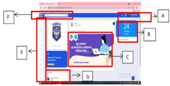
Figure 3. is the VISEL homepage display.

identical to the logo of SMP N 2 Pekalongan. After successfully logging in, the home menu appears for each account. The view of the homepage can be seen in the following Figure 3