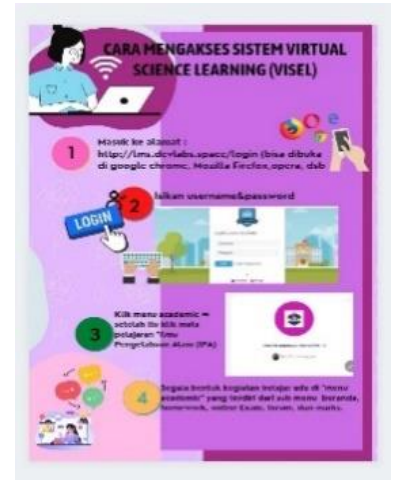
Figure 1. Instructions for Accessing VISEL

http://lms.devlabs.space/login with any device, whether smartphone, computer, and laptop and can be accessed in various browsers (google chrome, mozilla firefox, opera and so on). Instructions for using VISEL (Virtual Science Learning) can be seen in Figure 1.