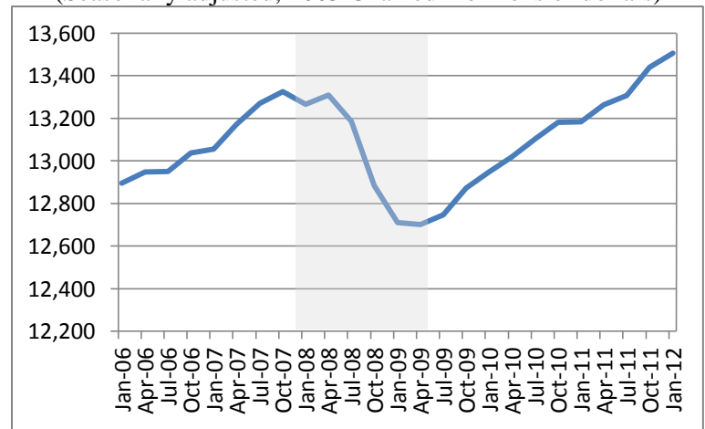
Figure 1. Quarterly Real GDP (Seasonally adjusted, 2005 Chained – billions of dollars)

Data from Bureau of National Economic Analysis <a href="http://www.bea.gov/national/index.htm#gdp">http://www.bea.gov/national/index.htm#gdp</a>.