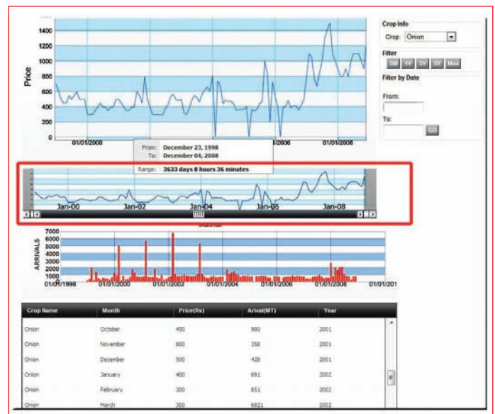
Fig. 4. Zoom Component - A zoom object with horizontal scroll bar enables the user to zoom graphical display area by expanding and contracting the zoom object.

Zoom: A zoom component is provided just below the primary graph display region which enables the user to expand and contract the zoom component, (Fig. 4) which in turn zoom the primary graph display area. The users are able to visualize the peaks with much clarity by zooming the date range. The years and prices are displayed in 'x' and 'y' axis. However, the exact data point could be obtained from the text data display box beneath the zoom component, by default, 10 years price is displayed.