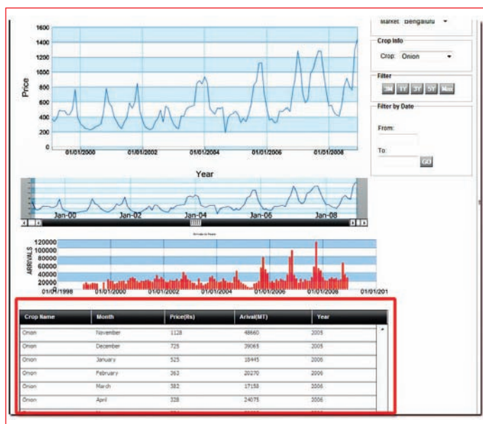
Fig. 5. Grid view data panel displays the exact text data of onion crop of Bengaluru market to view data points displayed in Graphs.

displayed in graph with text data. The data retrieved from large set of SQL database, the Fig. 5 above displays table view of onion price data.