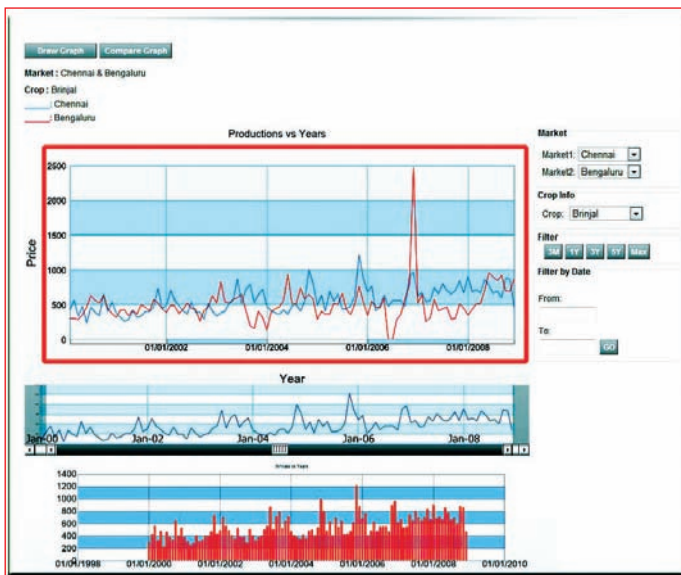
Fig 3. Compare options-Price comparison of two markets Chennai and Bengaluru for the Brinjal crop on clicking compare graph button, displays the price movement in both the markets

For example, Fig. 3 shows a comparison of market prices in Chennai and Bangalore for a selected commodity. Chennai price seems higher than Bangalore market price for most period, but a sudden steep rise is seen in Bangalore