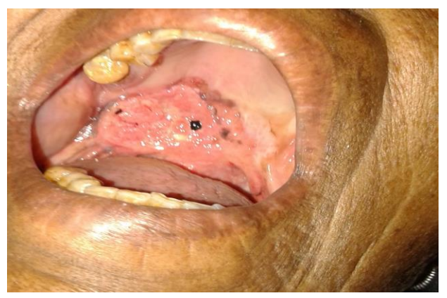
Figure 2: Gross appearance of an oral malignant lesion.

The accuracy, sensitivity and specificity of oral brush cytology for malignant tumors were calculated and found to be 86.36%, 81.25% and 100% respectively. Whereas brush cytology for detection of benign and inflammatory conditions revealed that all the 15 cases of benign tumors and 06 cases as inflammatory were confirmed as benign and inflammatory on biopsy respectively without any variation.