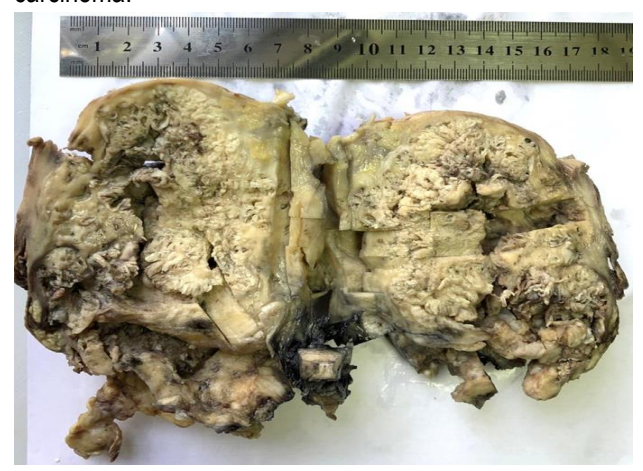
Figure 1: Grossly enlarged kidney along with ureter. Cut surface shows a large tumor almost completely replacing the renal parenchyma, grey-white and friable in appearance

similar morphology as seen in nephrectomy specimen, therefore representing remnants of squamous cell carcinoma.