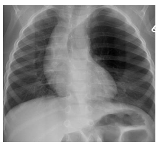
Fig 5: Congenital lobar emphysema on left side