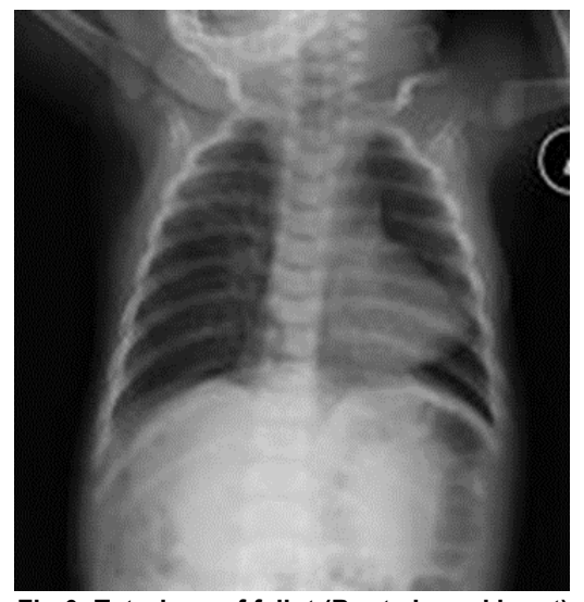
Fig 6: Tetrology of fallot (Boot shaped heart)