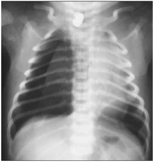
Fig 3: Pneumothorax