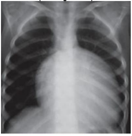
Fig 8: Ebstein anomaly (box shaped heart)