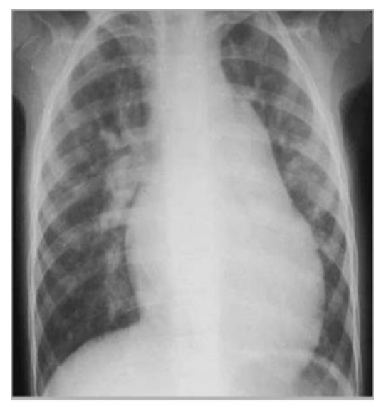
Fig 7: Persistant ductus arteriosus (left to right shunt)