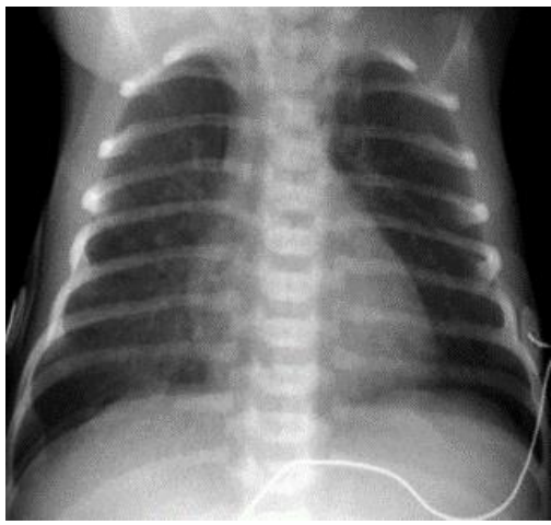
Fig 2: Meconium aspiration syndrome