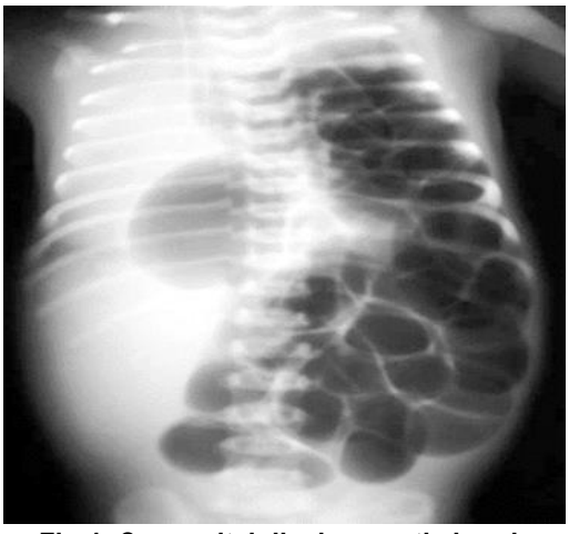
Fig 4: Congenital diaphragmatic hernia