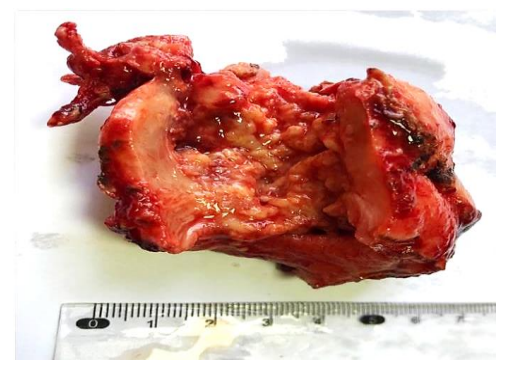
Figure-2: Showing gross specimen of Gall bladder with a fungating tumor diffusely involving the lumen and wall of gallbladder.