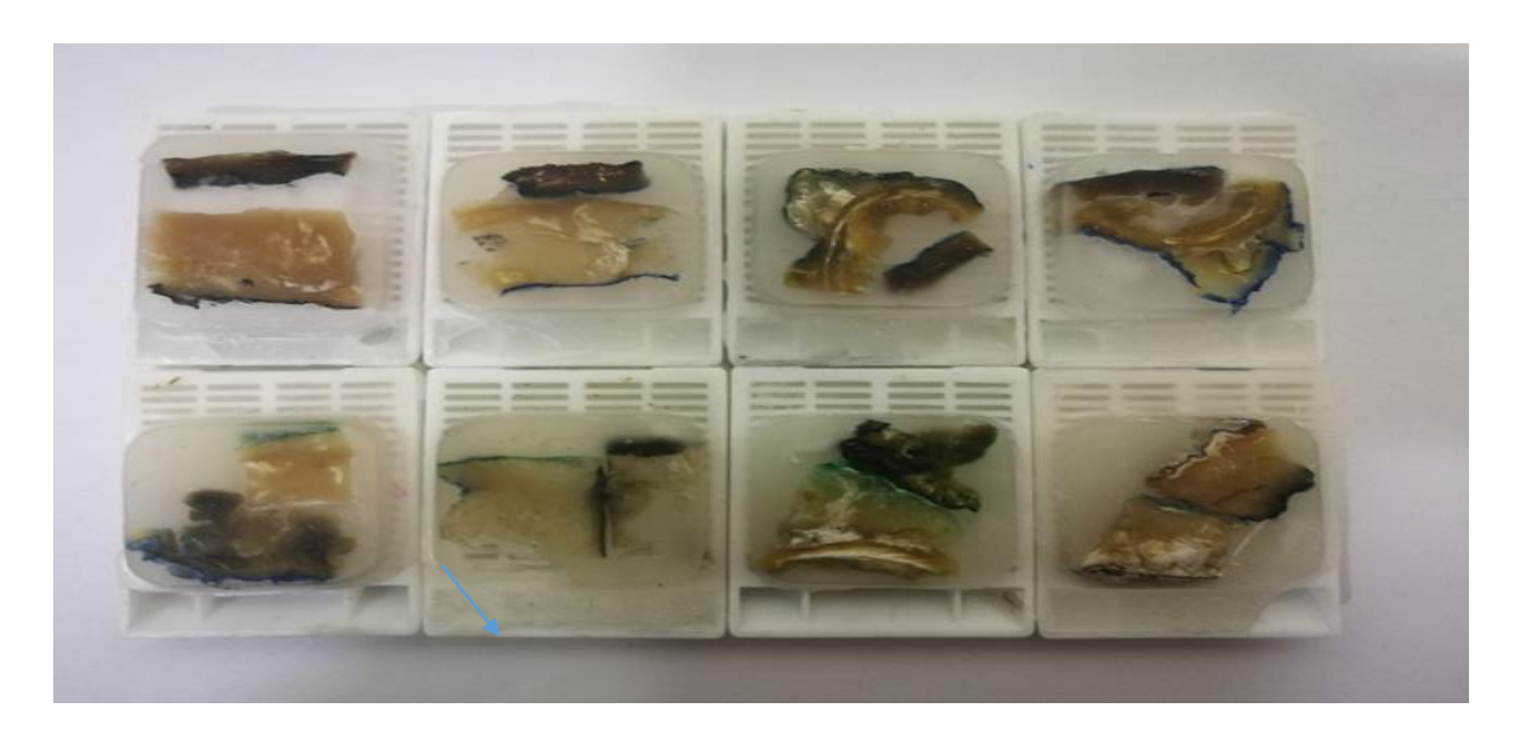
Fig2: The poster paint of blue, black and green colours is clearly visible by the naked eye on the section margins