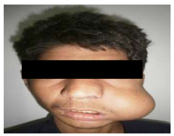
Figure-1 clinical picture

normal (Figure-1). The left nostril was obliterated with the mass whereas right nostril was clear. Intraoral examination showed a bimanual palpable mass in the left cheek extending to the left side of the soft palate. The soft palate was bulging down due to the mass and causing the oronasal obstruction. The overlying mucosa was normal. All cranial nerves were intact. There was no significant past medical and surgical history. Family history was also insignificant.