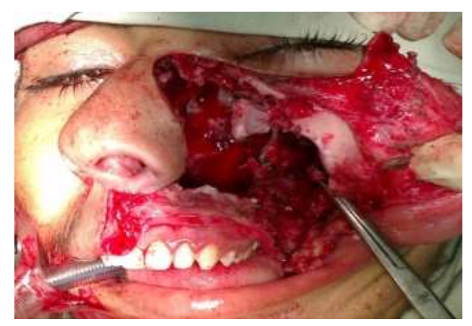
Figure-3 Per operative Pic