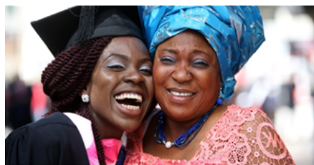
Fig. 2: Cardiff, U.K.