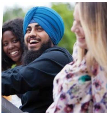
Fig. 1: Vancouver Island, Canada

background is not clear. As with Figure 1, this photo seems designed to present an image of an institution that celebrates and welcomes religious, ethnic, and national diversity.