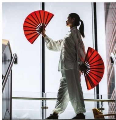
Fig. 5: De Montfort, U.K.