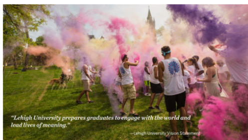
Fig. 6: Lehigh, USA

A second common trope we found in international strategies' choice of images was the use of traditional ceremonies and symbols to invoke an institution's sense of cultural diversity. For example, Figure 5 from De Montfort University (U.K., 2018) depicts a student of presumably Chinese heritage holding two red fans in what appears to be the staircase landing. There is not a clear message in this image, but it does seem designed to signal that "Chinese culture is here."