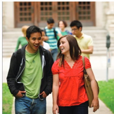
Fig. 4: Western, Canada

Figure 4 appears on the cover of the strategy from Western University (Canada, 2014). This photo, like the others, seems designed to highlight a harmonious, diverse campus by representing a number of Asian students (some blurred out) mingling well with white students on campus. The image focuses on a man, who appears to be of East Asian heritage, and a young white woman smiling and chatting. As with Figures 1, 2 and 3, these students may not be international, but they do convey a sense of opportunities for positive interactions with members of different genders, and those from different racial, ethnic or religious backgrounds.