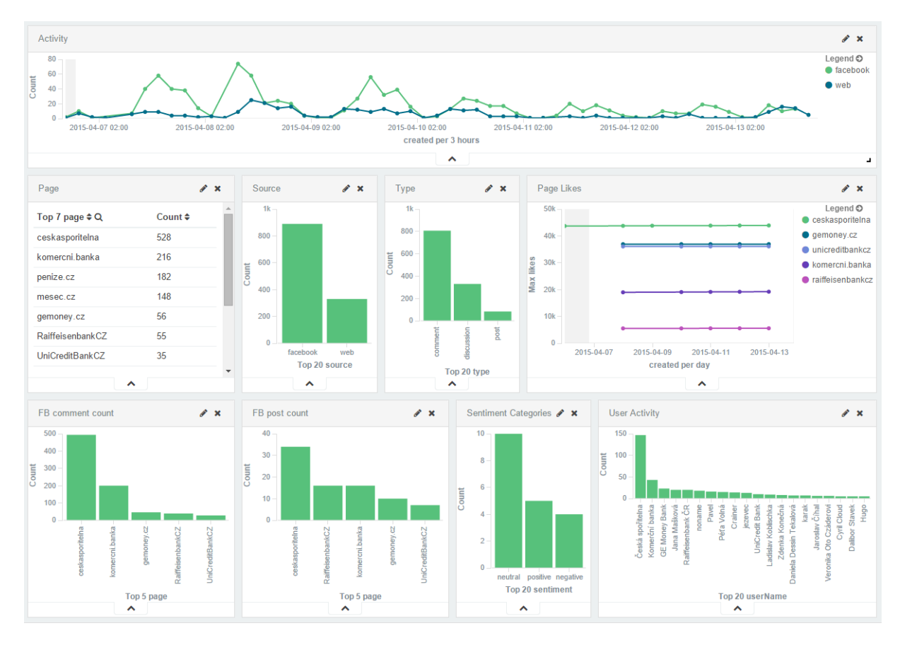
Figure 3: Preview of the Overview dashboard (authors)