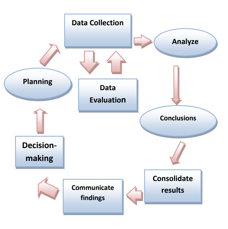
Figure 1: Competitive Intelligence Model (Compiled from Murphy, 2005)

The basic model that the CI methodology follows involves a Cycle where Intelligence can be viewed as a process and as a product – the intelligent result - (Bose, 2008). The following figure shows an adaptation of the approach proposed by Murphy (2005):