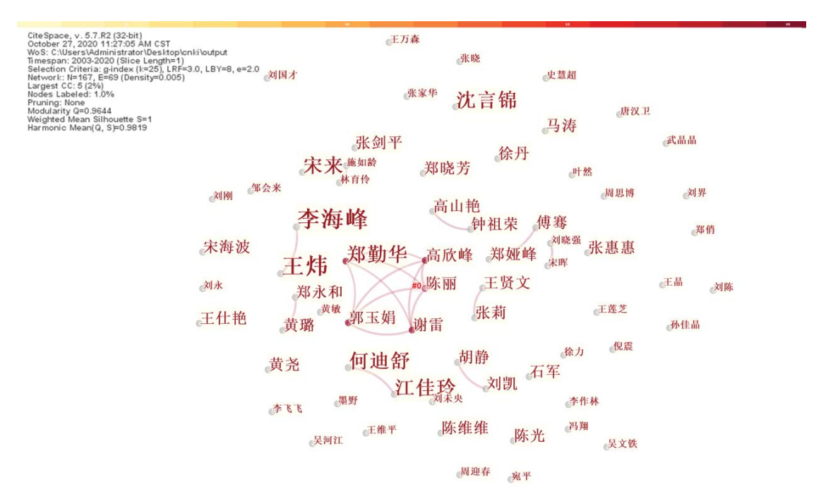
Figure 1. Visualization of authors of research on the application of artificial intelligence in education.

The node type was changed to the institution, and the software was run to obtain the visual mapping of research institutions on the application of AI in education, as shown in Figure 2. The top 10 institutions in terms of the number