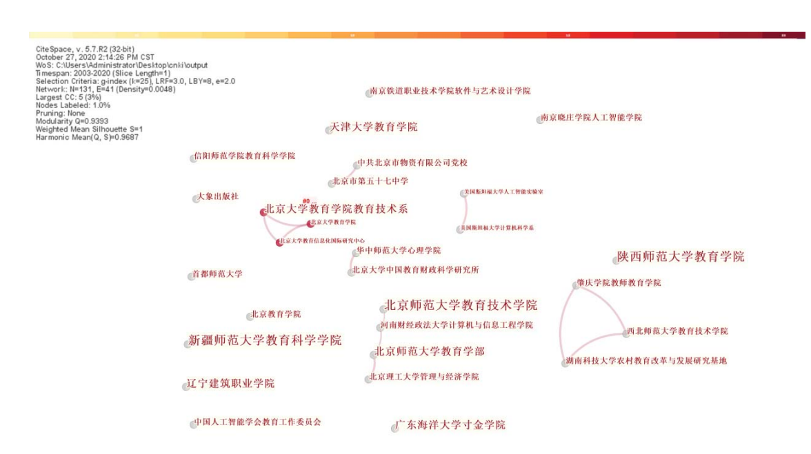
Figure 2. Visual mapping of research institutions on the application of artificial intelligence in education.