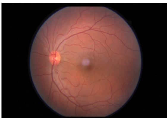
Fig. 2. Normal fundus of the left eye

Intraocular pressure were 22 mmHg and 16 mmHg in the right and left eyes respectively. Ocular findings were suggestive of CRAO of the right eye. Ocular massage for 15-20 minutes was done and oral carbonic anhydrase inhibitor 250 mg four times for a day was given as for the conservative management.