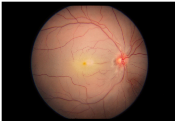
Fig. 1. Pale retina with cherry red spot on right fundus

A 32 years female presented to the emergency department with the chief complaint of sudden and painless loss of vision in her right eye for one day. She had no significant medical and surgical history. She did not give any history of trauma or other precipitating events and was not under any regular medication. On examination, her best corrected visual acuity was perception of light (LP) and 6/6 in right eye and left eye respectively. On slit lamp bio-microscopic examination, anterior segment of both eyes were normal except relative afferent pupillary defect was positive in right eye. Right fundus showed pale retina and cherry red spot whereas left fundus was found to be unremarkable on posterior segment examination (Fig.1 and Fig.2).